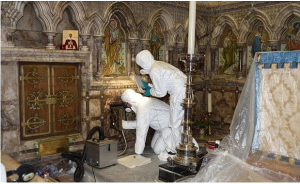
Scientists at work, conserving the relics of St Eanswythe