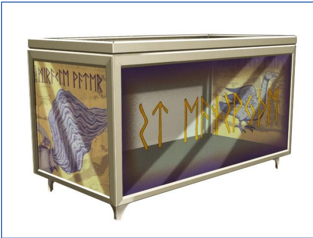
The proposed new reliquary for St Eanswythe

During the past four years this church has gone from strength to strength and is really on the map. This is due to many factors, but includes the scientific proof that our relics of St Eanswythe are genuine, together with the design and commissioning of the new reliquary for St Eanswythe – and the worldwide media coverage from these attracted a great deal of interest.