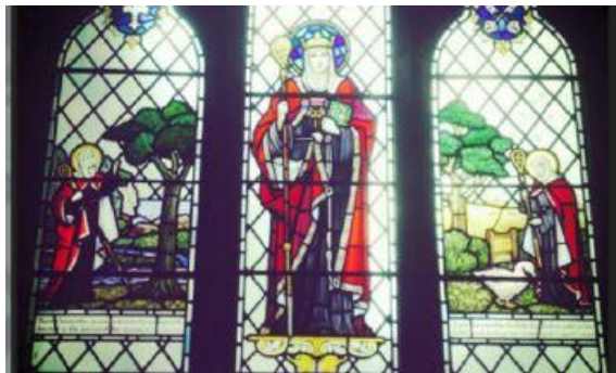
The St Eanswythe window depicting two of her miracles

St Eanswythe is also Folkestone's patron saint. She served in ways that were new for her time and we want to follow her example. We want to use our resources for everyone in our parish. Our parish expands northwards with part of the former parish of St Saviour, and we need to involve that part of Folkestone much more so that we can continue to serve all people and make God's love a reality for them, as Eanswythe did for those around her. The now well-established Companions of St Eanswythe, which aims to use the monastic wisdom of Lectio Divina and Contemplation for spiritual growth, has a diverse membership from a variety of backgrounds and should be expanded.