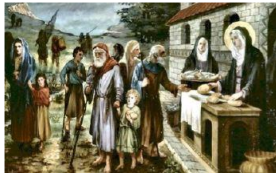
St Eanswythe ministering to the poor

Our mission and ministry reach beyond the confines of our building, beyond our regular congregation and even beyond the confines of our denomination and faith, welcoming as we do people of all faiths and none. The warm welcome people from the community receive when they visit the church or attend occasional offices has encouraged them to join the congregation to develop and explore their faith.