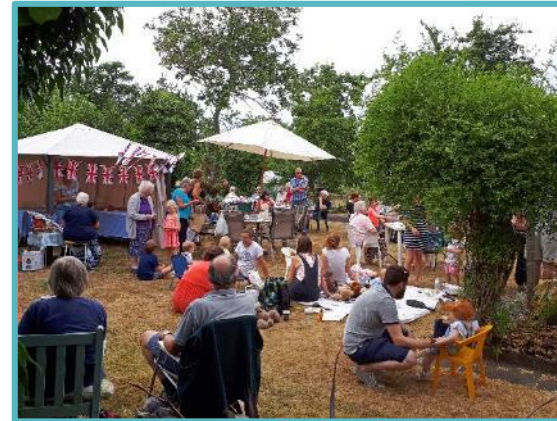
Teddy Bears Picnic