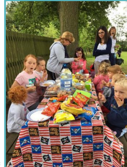
Junior Church Summer Picnic

We have a Junior Church leader who coordinates volunteer parent leaders and helpers. There is one all age group with members which currently are mostly pre-school age. When the children return to the main service, it is in time for them and their parents to receive communion or a blessing. Before the final hymn, the children have the opportunity to share their activities with all the congregation.