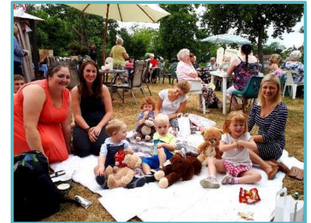
Teddy Bears Picnic