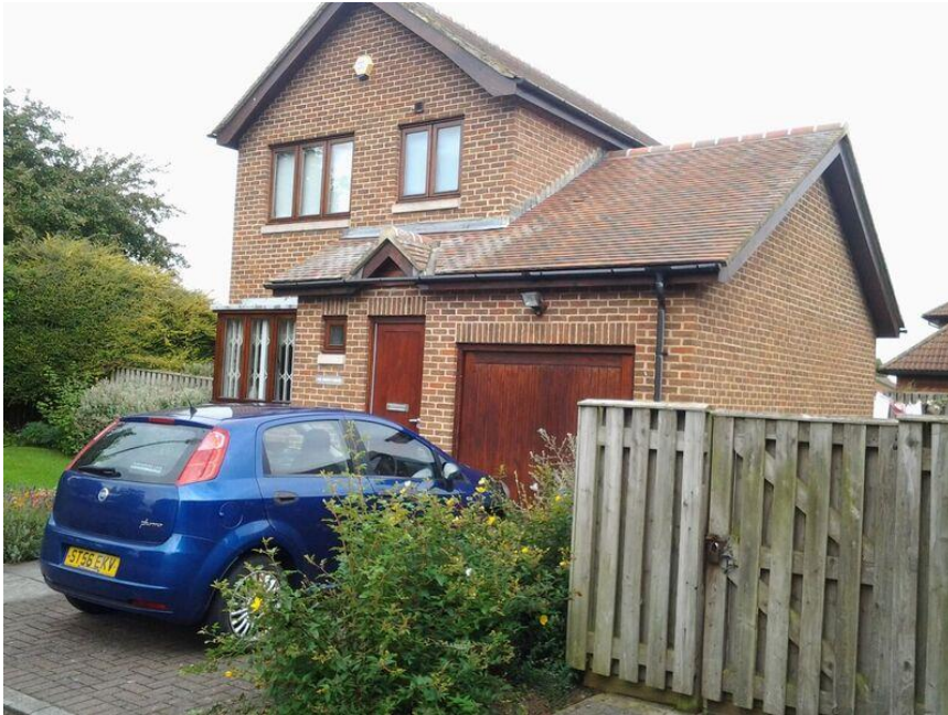
The Curate's House

The four bedroomed vicarage and gardens at the rear of the church are currently being refurbished and the curate's house at the front has been kept in excellent order by the tenants who occupy it at the moment. Both houses have gardens and the forecourts are paved