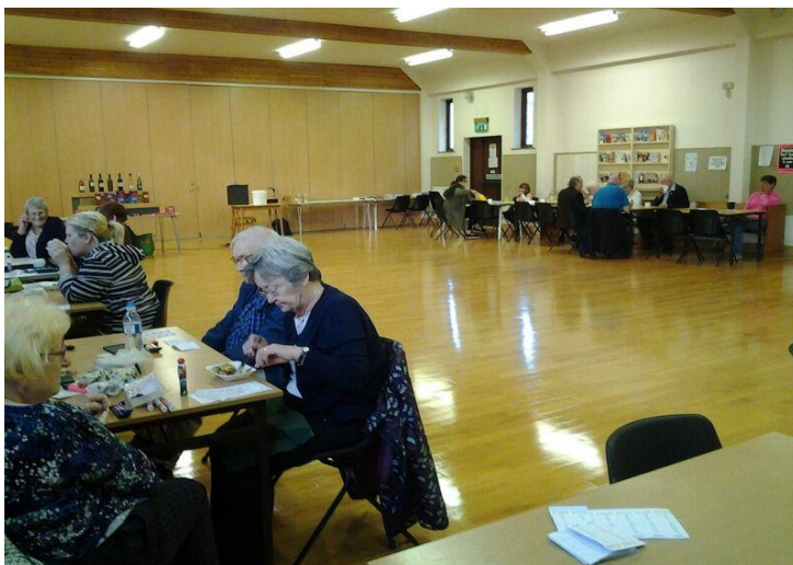
Pie & Pea evening

We have a lively group of people who organise social events, including monthly Pie & Pea Suppers with Bingo. We hold two Fayres, one in the summer and one near Christmas.