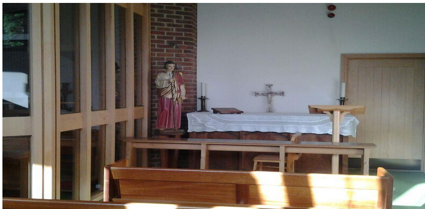
St. Thomas Chapel