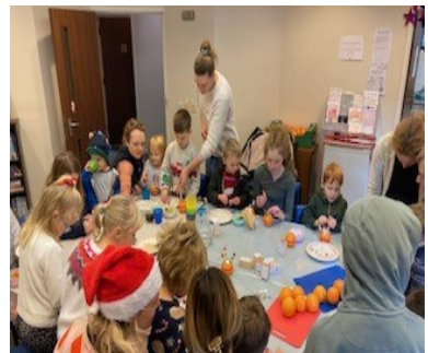
Children busily making over 100 Christingles

Equally treasured is our four-part robed choir, currently about 20 members. The choir sings a wide variety of music throughout the church's year. Our aim is to enrich worship through the words and music of the liturgy, drawing on both traditional hymns and contemporary worship songs as appropriate to the occasion.