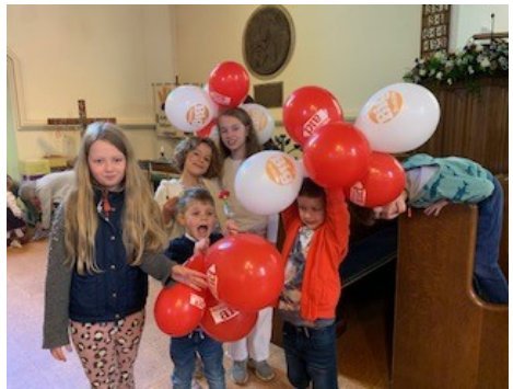
Children with Christian Aid Balloons