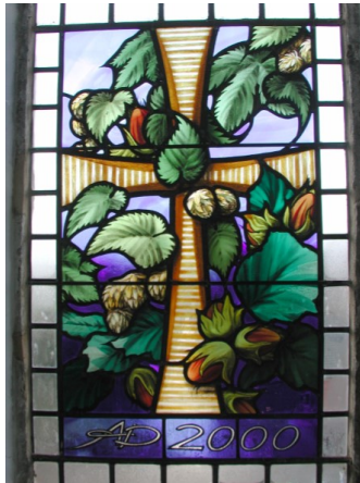
West Window Installed to Mark the Millennium