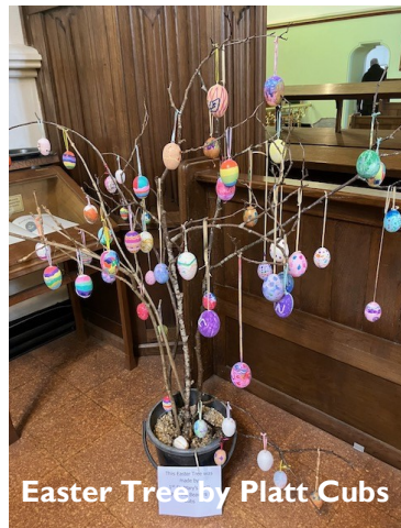
Easter Tree by Platt Cubs