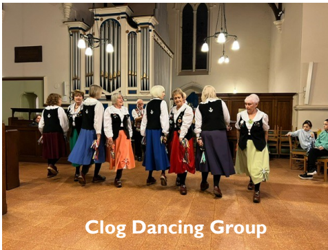
Clog Dancing Group