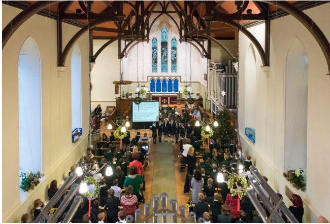
Platt School children leading a school service in church.