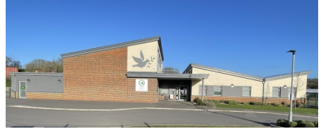
Platt CofE (VA) Primary School

There are a number of primary schools in the area, including our own Church Aided primary school. One of the two secondary schools in nearby Wrotham has specialist provision for those with autism.