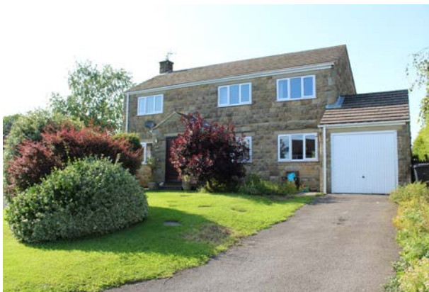
The house at HG4 3BL

The previous holder of the house for duty post says: “Grewelthorpe is a delightful village to live in with lots going on. There is a real sense of community, neighbours are friendly. Ready access to walks and woods.”