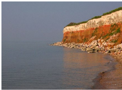
Hunstanton Cliffs at high tide.