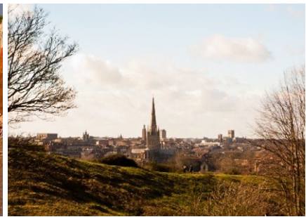
Norwich with its Cathedrals and Castle.