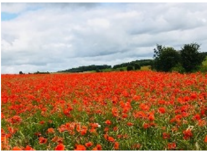
Norfolk poppies in the fields.

The historic town of King's Lynn is just minutes away and we must not forget the wonderful city of Norwich. It is the most complete medieval city in the UK with stunning Norman Cathedral and Castle. It has a flourishing arts, music and cultural scene, superb independent as well as High Street shopping, quaint covered market and a heritage that is a delight to explore.