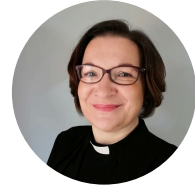
Jane Bakker Archdeacon of Plymouth

Plymouth 2035 is an ambitious project to bring transformation to the Church of England across the city. Spanning the next decade, it will bring new life to mission and ministry in Plymouth. This role offers an exciting opportunity to be a part of reshaping the church in the east of the city.