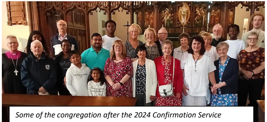
Some of the congregation after the 2024 Confirmation Service

Funerals in Church 2022 – 4 2023 – 8 2024 – 3 (to May)