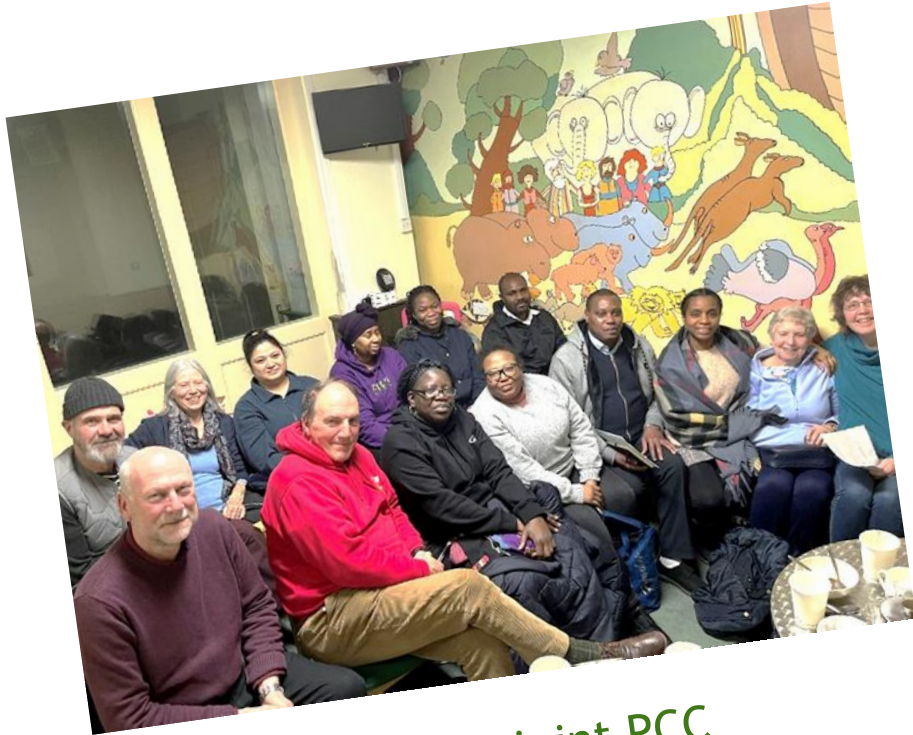
A recent joint PCC meeting held in the creche at St James to keep us warm

Thank you for expressing an interest in the post of Interim Mission Priest at St James & St Anne's Bermondsey.