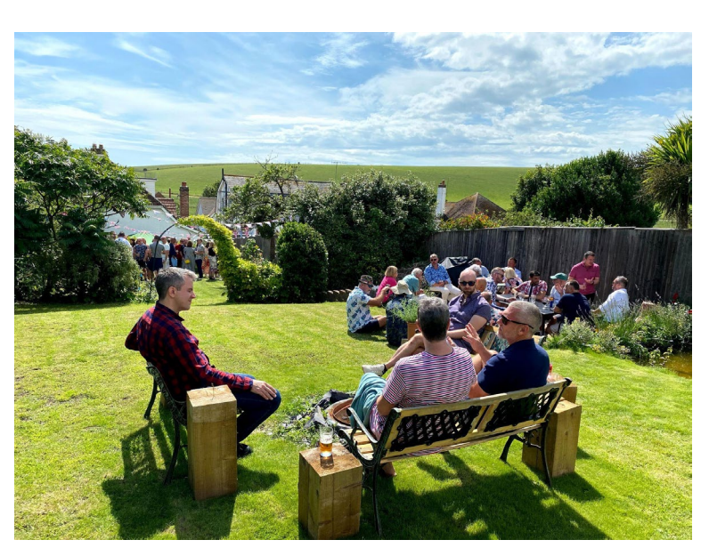
Summer Garden Party at the Rectory