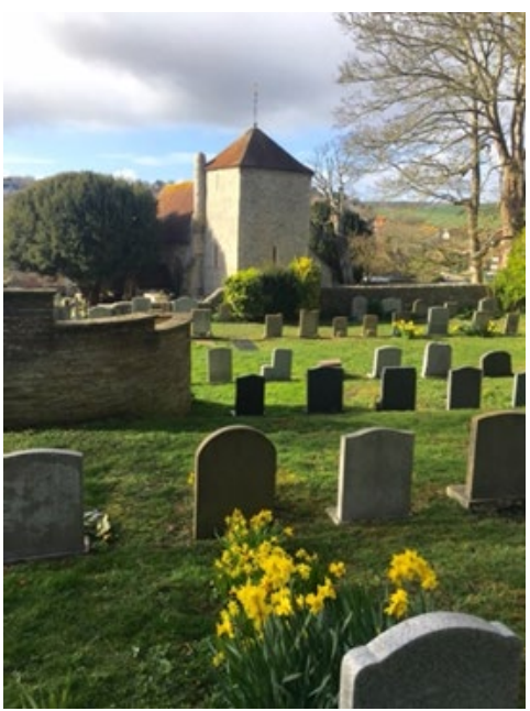
Section 1 - Could you be our new Priest?