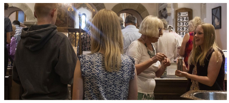
Young people at All Age Worship