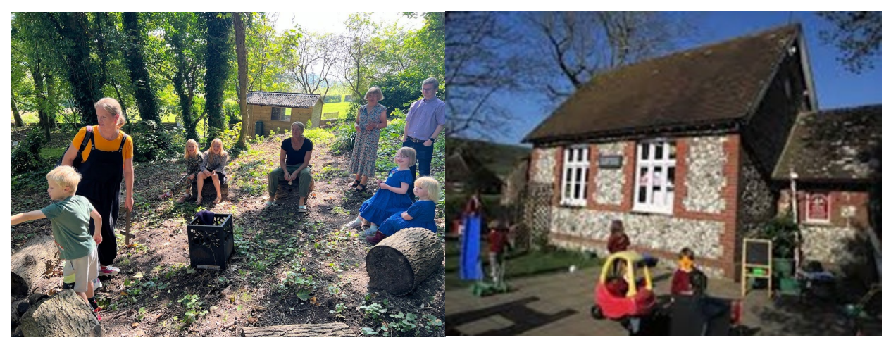
The Copse - a base for children's activities

St Wulfran's has supported the Ovingdean Arts Club over the past 20 years, and its affiliated Choral Society. There has been a long tradition of drama productions and in recent years a community theatre group has put on pantomimes involving children and all ages, with encouragement from St Wulfran's. There is also a Nursery School (operating in the Church Room) and a Parent and Toddler Group. The Nursery School has strong links with St Wulfran's and holds regular activities in the church. St Wulfran's has also supported "Wulf in the Woods" – a programme of Forest School activities for children in the copse above the churchyard, working in partnership with experienced leaders in the local community. Ovingdean Hall and its grounds (formerly a residential school for deaf children) is now the base of Oxford International College (Brighton) – an independent boarding school for high achieving (mainly overseas) students. The principal and staff are keen to collaborate with St Wulfran's.