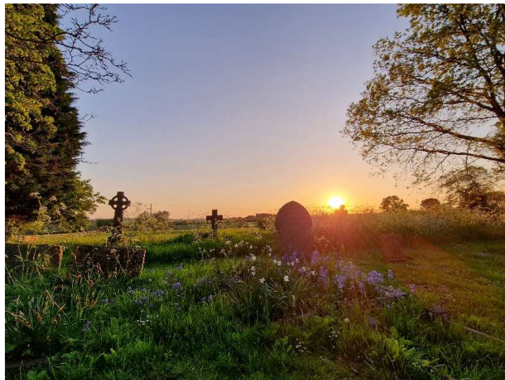
Sunset from the churchyard