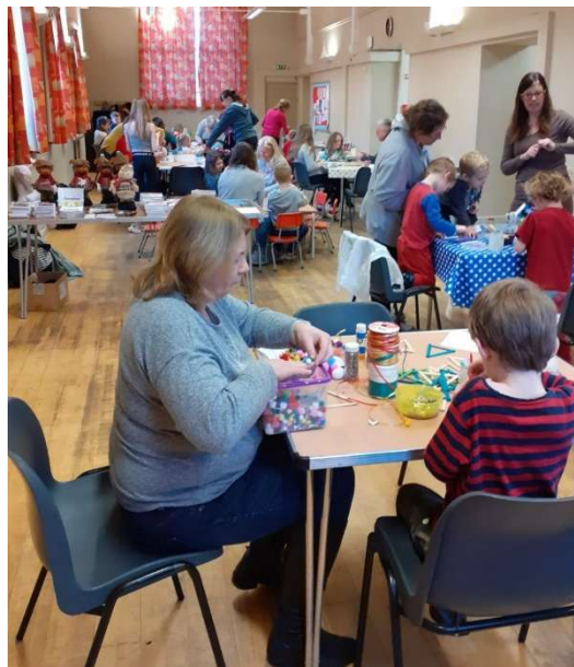
The Christmas craft session