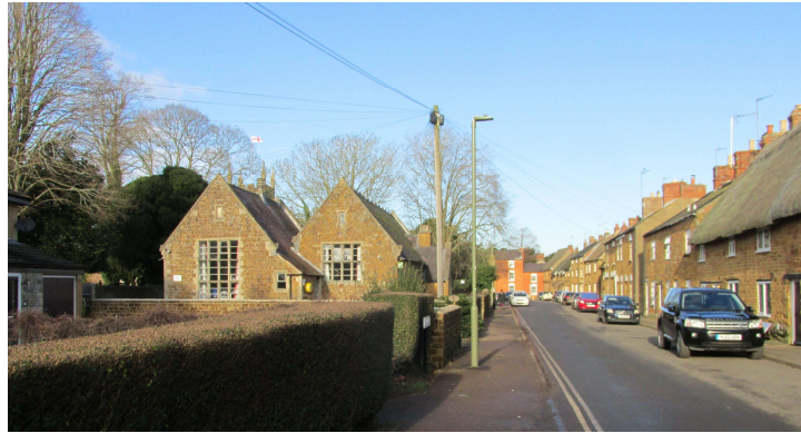
Church Street, Bodicote