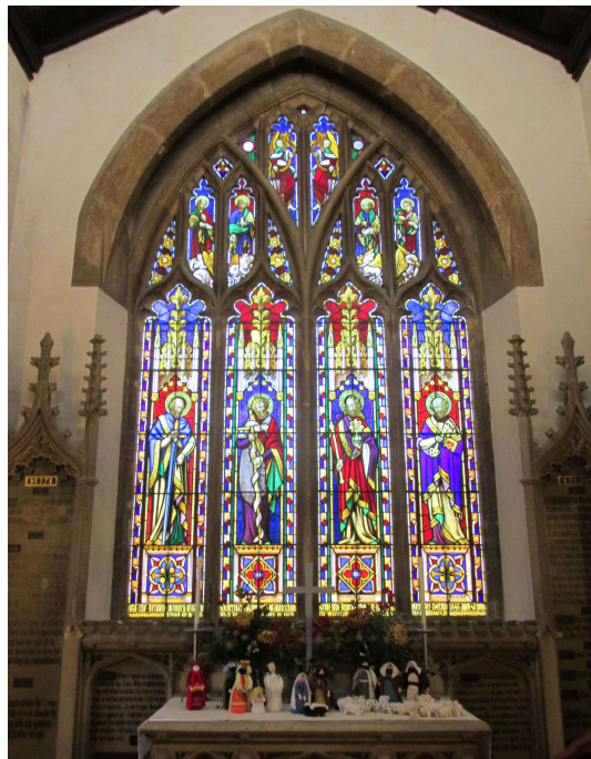
The East Window

Further alterations and amendments to the Church fabric have continued throughout the years, including relatively recent repairs to the beautiful stained glass East Window. Today, St. John the Baptist Church stands as a Grade II* listed building, with a capacity of approximately 200. The tower has a ring of eight bells and an iron-framed turret clock.