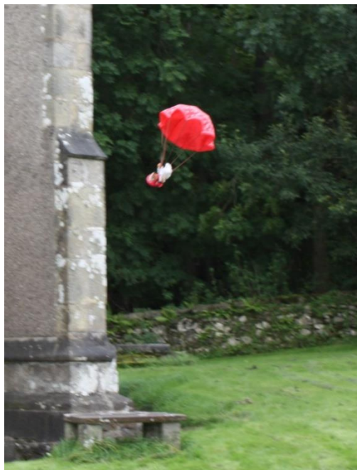
Teddy Bear parachuting from church tower during flower festival and Village Gala