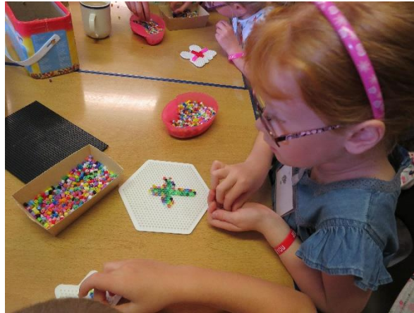
Fish Club Activity

Although there is no longer a youth club in the village, Capernwray Hall hosts monthly 'Rock Solid' meetings for 14-25 year olds for fun, fellowship and following Jesus.