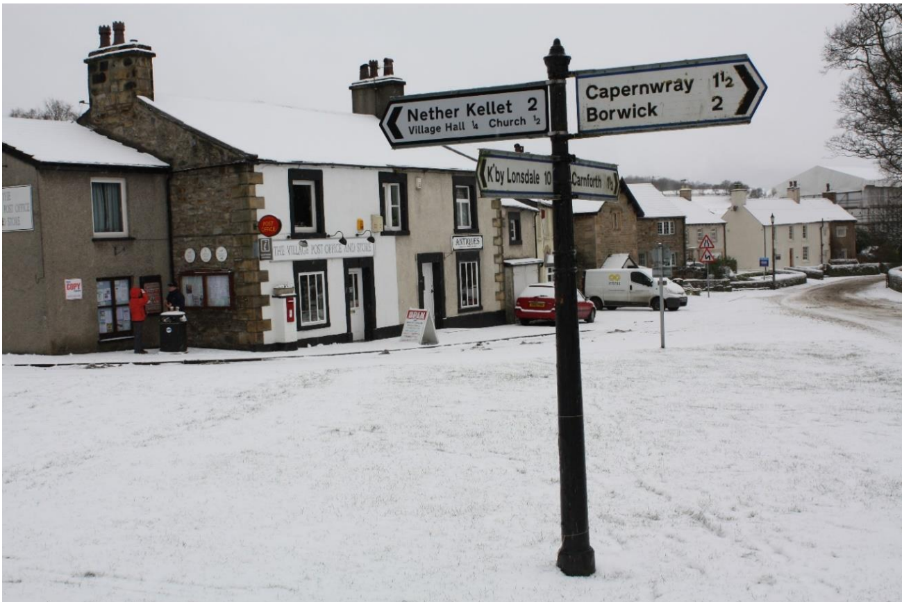
Over Kellet Village Green in winter

Hyperfast fibre broadband (Broadband for the rural north - B4RN) is available for many homes in Over Kellet and in 2018 will be available for St Cuthbert's Church for internet access at no charge. www.b4rn.co.uk