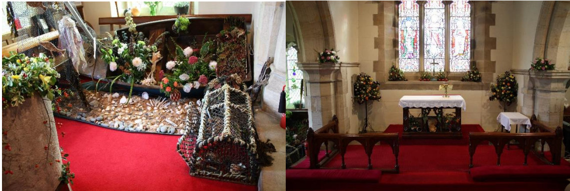
Flower Festival 2016

Lighting of the Village Christmas tree on the Village Green attracts nearly 100 people for carol singing, refreshments and fellowship.