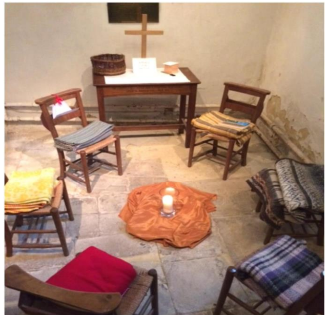
A place for prayer

Our worship is supported by a strong musical tradition with our choir playing an important part. We are supported by a gifted young organist.