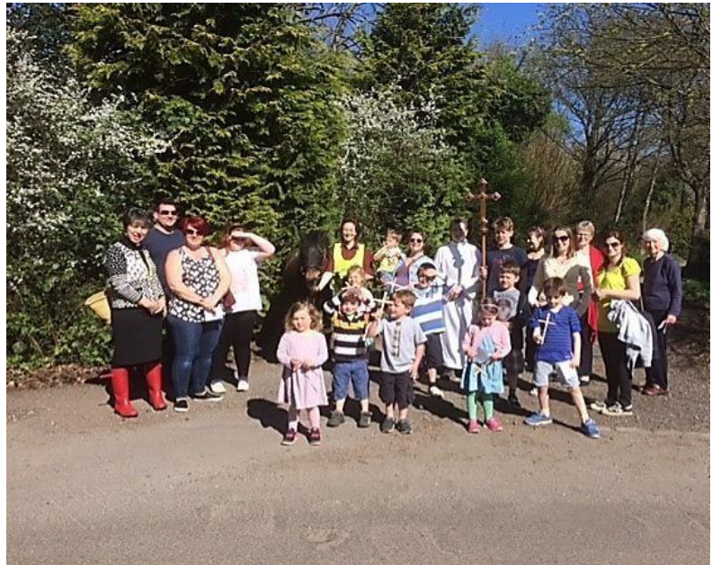
Palm Sunday Procession

Although there is no obvious centre to the village, the Church, the village hall, the school and the local pub bring points of focus.