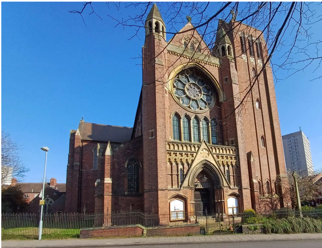
The West Façade of the Church viewed across Stanhope Street