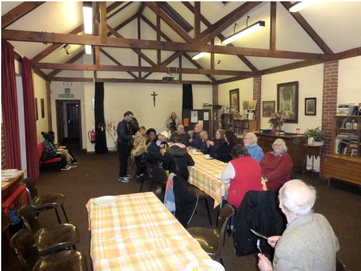
St Patrick's Room – Our Church Hall