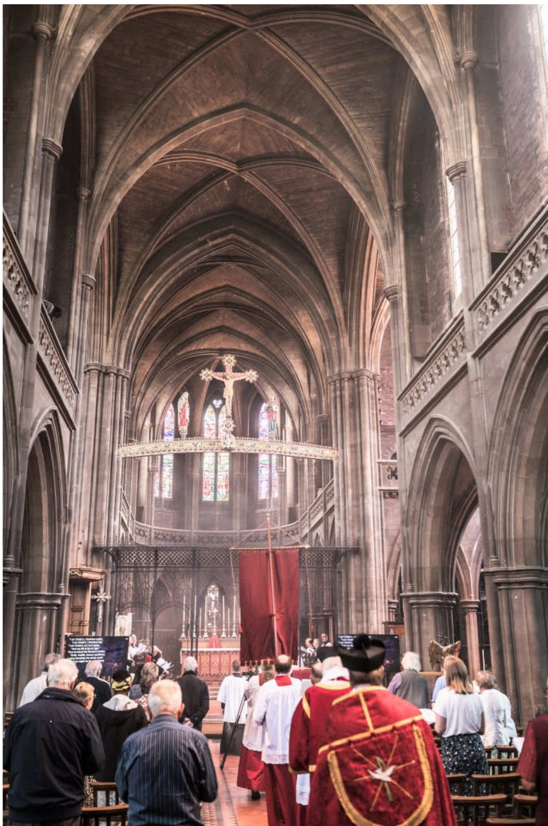
The interior looking east from the west end of the Church