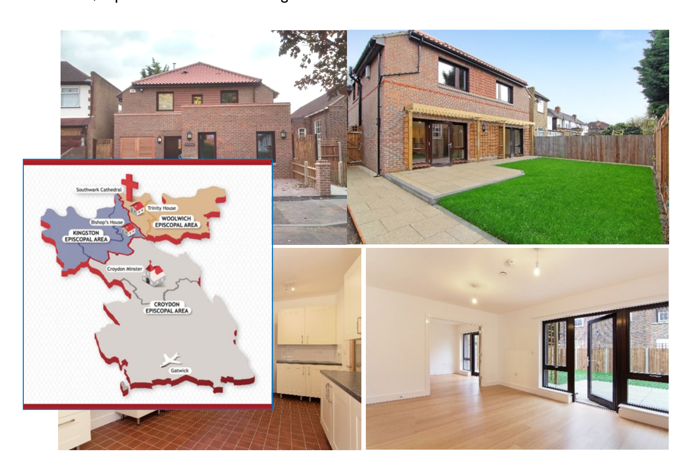
The Diocese of Southwark

A new Vicarage at 25A Molesey Drive, North Cheam (next to St Oswald's) was completed in late 2015. It has four bedrooms, a large sitting room, dining room, kitchen and utility room. The study is at the front of the house, separate from the main living areas.