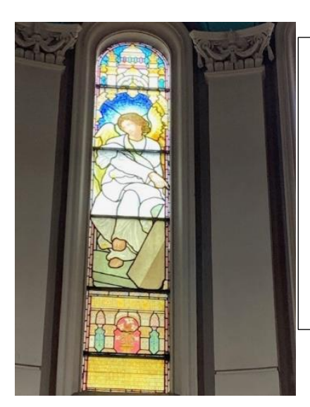
Stained glass in the Church portrays apostles and prophets