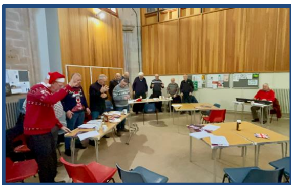
Men's Christmas Breakfast 2024