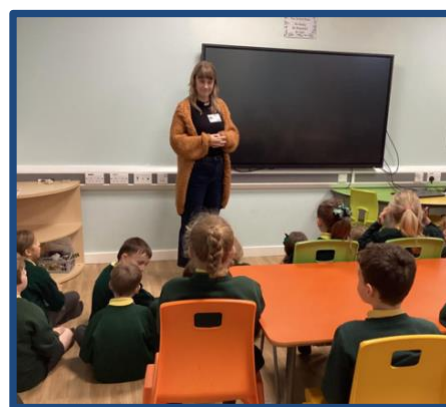
Our Clergy Visiting St Philip's School

St Philip's School is a Voluntary Aided Church of England Primary School located directly opposite St Philip's Church. The school aims to provide a nurturing, safe, and inclusive environment where each child can achieve their full potential. Guided by Christian values, St Philip's has a loving family atmosphere, emphasising the development of spiritual and moral values alongside academic excellence. The school maintains strong links with the church, enhancing its religious education and community involvement. In their most recent Ofsted inspection on 8 November 2023, the school was rated 'Good' overall, with 'Outstanding' in Personal Development.