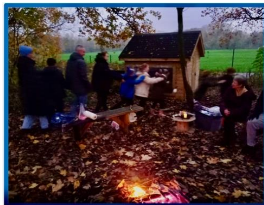
Hindsford School Family fun at Forest Worship

Hindsford Church of England Primary School is a one-form entry school with a capacity for 210 pupils, admitting up to 30 children into the reception class each year. The school has close links with St John's Church, and some of the children and teachers join us for our monthly all-age Eucharist service. Pre-vacancy we also ran a weekly (after school) forest-worship something the children and parents really engaged with. We would love this to start again when we are able as we regularly had over 20 people attend. In their most recent Ofsted inspection on 29 October 2024, the school was rated 'Outstanding' in all key areas, including Quality of Education, Behaviour and Attitudes, Personal Development, Leadership and Management, and Early Years Provision.