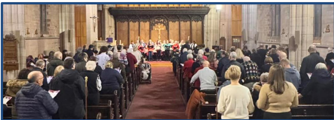
Christmas Carol Service 2024 at St John's