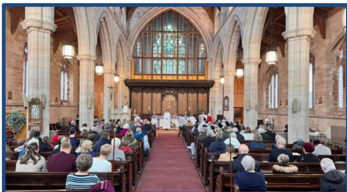
Our outgoing Rector's Final Sunday Eucharist at St John's Church

On a rotating basis Eucharistic services are held in two churches every Sunday, and morning worship in the other two. In addition, there are two mid-week Eucharist services, one in each parish. All major