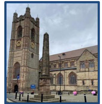
St John's Church (Atherton Parish)

Atherton is a traditional Lancashire town with a strong family-oriented ethos, home to professionals, skilled tradespeople, and a diverse mix of residents. Historically, the town was built on industries such as nail, nut, and bolt manufacturing, later followed by mining and cotton. While local industry is now limited, many residents commute to Manchester or nearby towns for work. The town centre is a lively hub with a variety of restaurants, cafés, and bars, supported by a strong community-driven effort towards retail regeneration. Its industrial past is still visible in two repurposed mills, now hosting retail and leisure facilities.