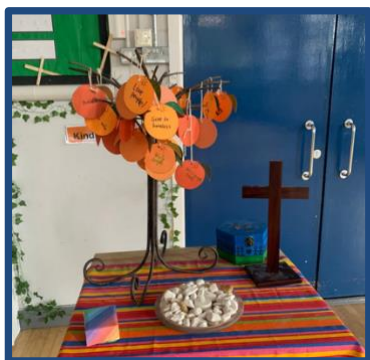
St Michael's School Prayer Tree

St Michael's CE Primary School in Howe Bridge is a Voluntary Aided school that immerses students in a Christian community. The school encourages, challenges, and nurtures each child to learn and grow, aiming for them to achieve their full potential. The school's values are Love, Respect, Kindness, Faith, Honesty, and Courage. St Michael's maintains a close relationship with St Michael's Church, with visits, and the school participating in church and community events. On one recent visit the children made a prayer tree, as can be seen in the photo. In their latest Ofsted inspection on 31 October 2023, the school was rated 'Good' across all evaluated categories.