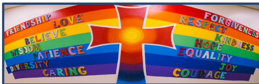
Banner displayed in St Philip's School Hall