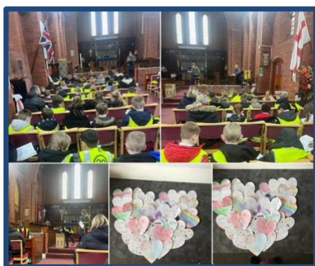
St George's School Children Visiting St George's Church

Atherton St George's CE Primary School is part of The Wings' CE Trust and caters to children aged 2 to 11. The school is committed to ensuring that every child achieves their full potential in a happy, safe, caring, and Christian environment. With high expectations for attainment, achievement, attitude, and behaviour, St George's provides pupils with aspirations to be the best they can be. The school has a long-standing history in the community, established for over a century, and enjoys strong links with St George's Church, situated directly across the road. In their latest Ofsted inspection on 20 June 2023, the school received a 'Good' rating.