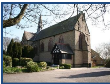
St Michael's Church (Howe Bridge)