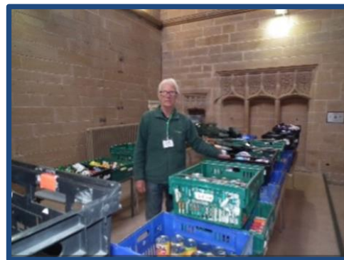
Atherton & Leigh Food Bank Distribution Day