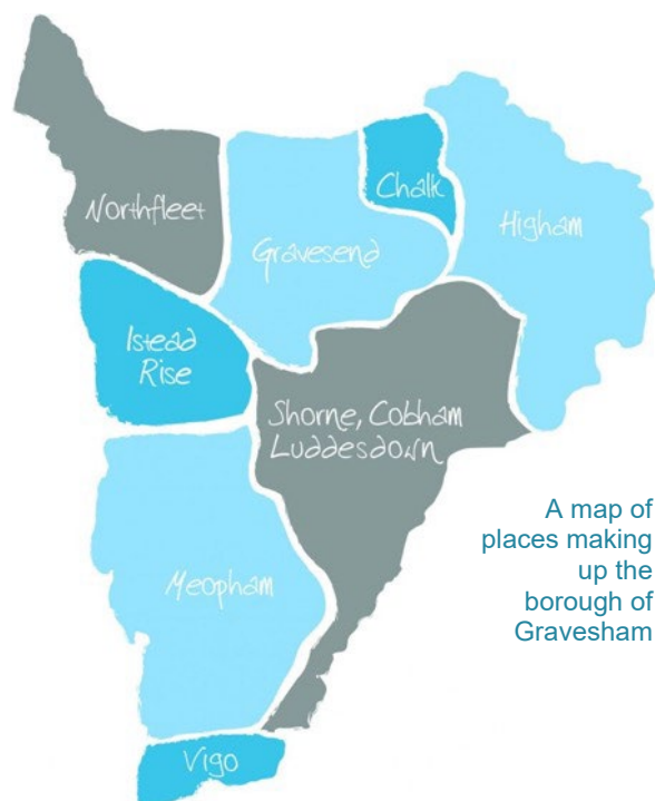
A map of places making up the borough of Gravesend