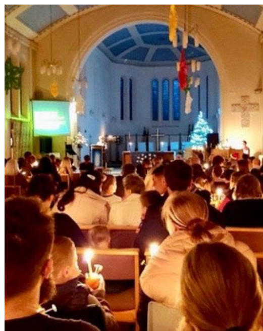
Christingle service on Christmas Eve