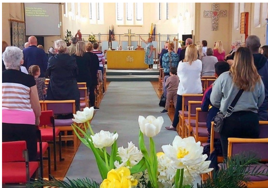
Sunday morning worship