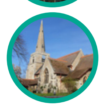
Stretham St James Page 14