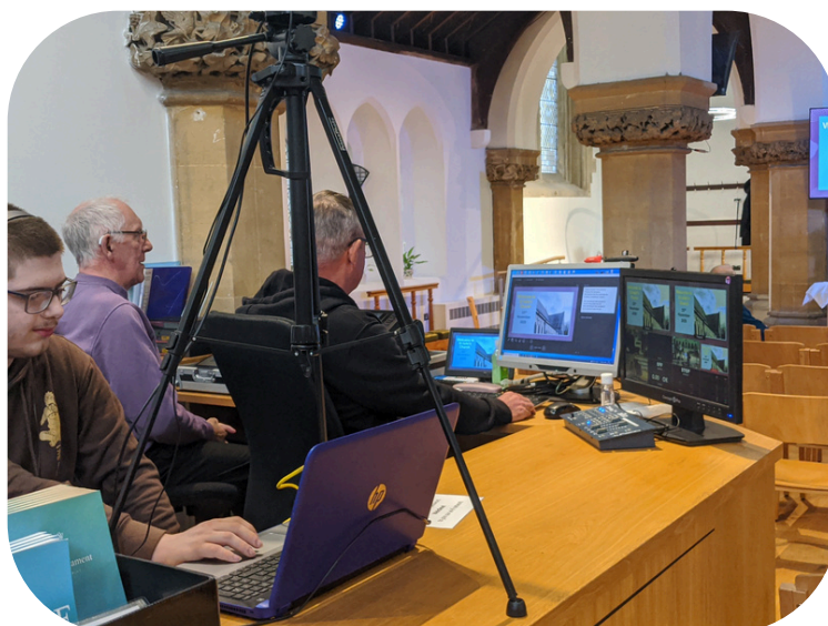
Next Era project team member

"We saw many miracles unfold during the Next Era building project and were guided by the watchwords of Patience and Faith."