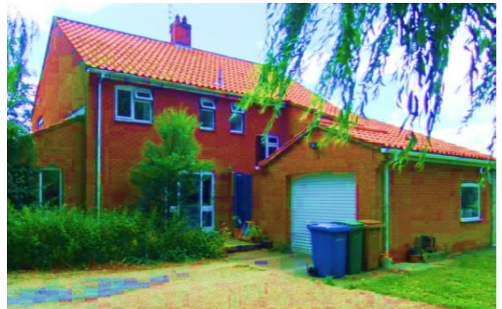
The rectory at Holme on Spalding Moor

The Rectory (Church House) is located in the village of Holme on Spalding Moor, at the foot of Church Hill and near the centre of the village. It is a modern family home with good sized accommodation which consists of a sitting room, dining room, kitchen, utility room, study and cloakroom/wc on the ground floor. On the first floor there are four bedrooms with a family bathroom. Outside, the property has a garage with large gardens laid to lawn. The property has gas-fired central heating.