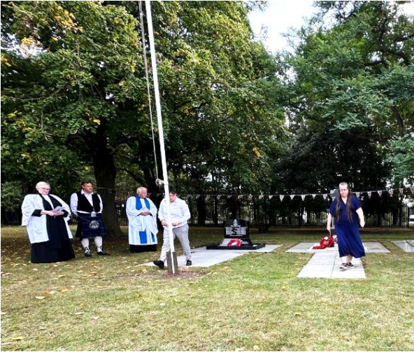
All Saints has close links with the former Bomber Command's 76 Squadron.