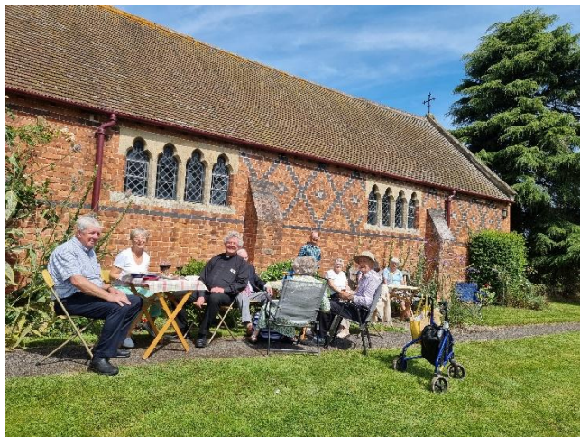
A highlight of the benefice year is the annual picnic held at Bursea