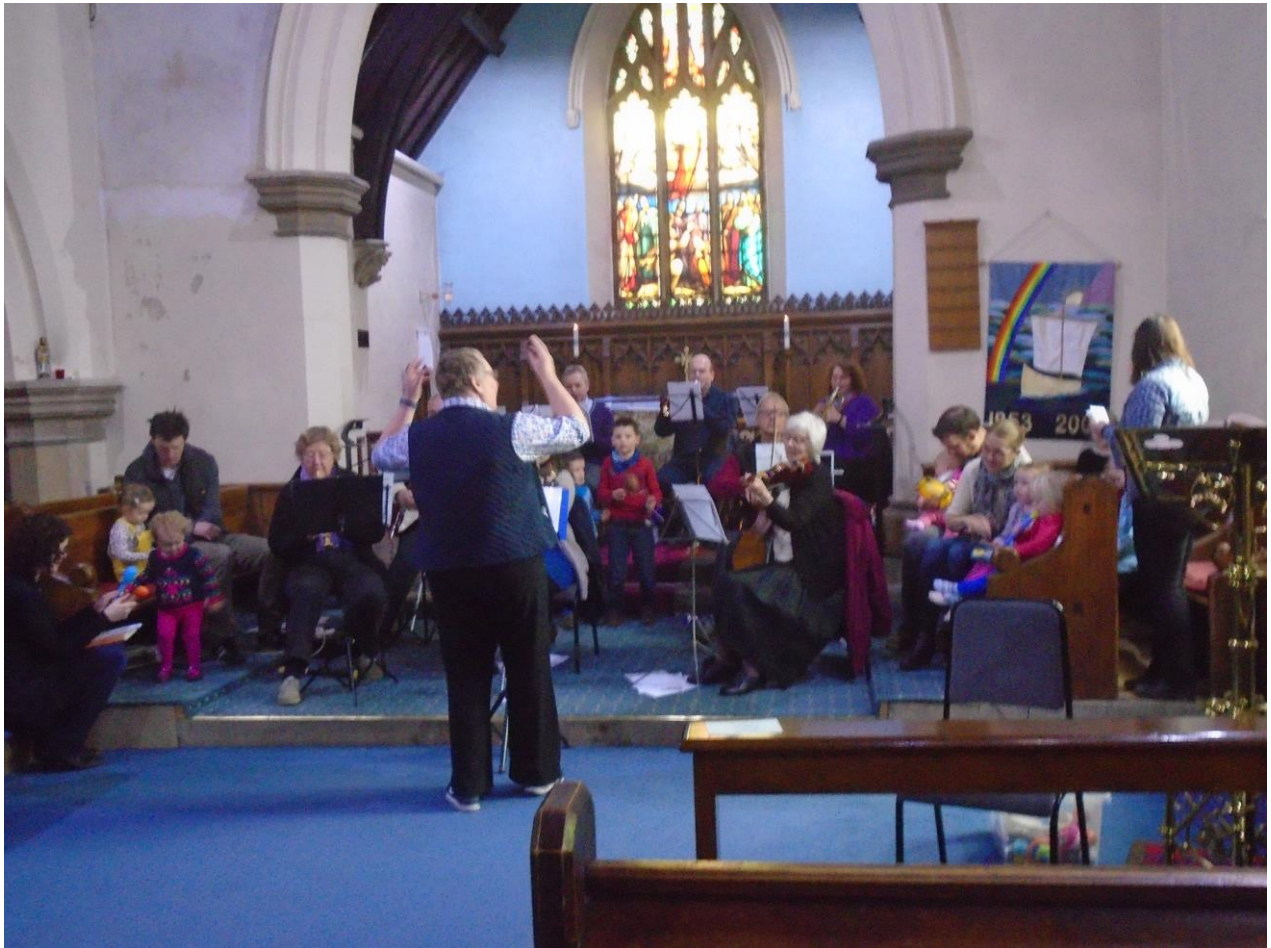
All Age Worship in full Swing