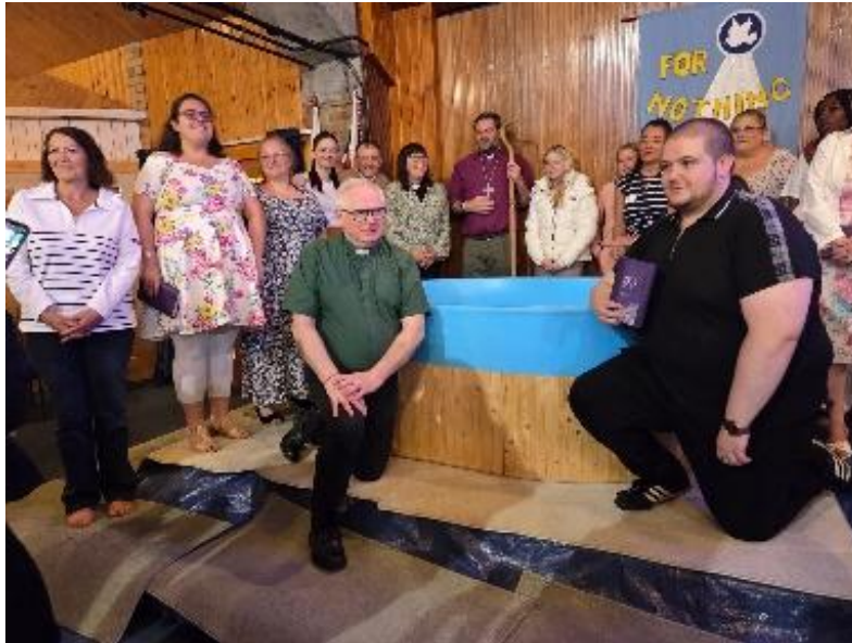
Baptism candidates July 2025