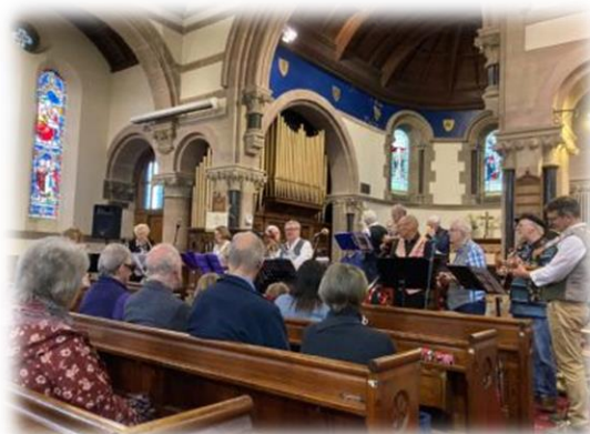
Clitheroe Ukulele Orchestra Concert

Our Way Forward group supports our Mission and Worship and how we take the Diocesan Vision forward. Our Vision Champion works tirelessly to encourage and publicise the work done at Christ Church.