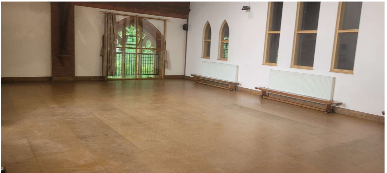
View of first floor hall.

The income from all these groups is helping St Barnabas grow. It does not just have a monetary value; it is also welcoming more adults and young people into our church building which we hope in turn will increase our parish numbers.