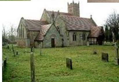
The Church, Baxterley