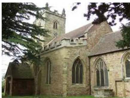
SS. Peter & Paul, Kingsbury