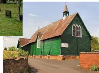
The Church of the Resurrection, Hurley

“Serving our villages in faith, unity, and love.”