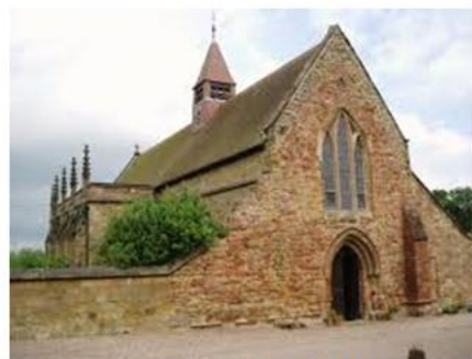
The Church of Our Lady, Merevale

The Kingsbury & Baxterley Group of Churches, North Warwickshire