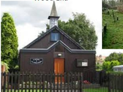
St. Michael & All Angels, Wood End