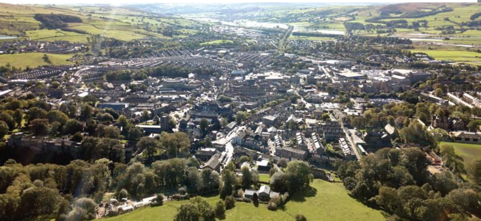
Aerial view of Skipton, looking southwards towards the Aire Valley

The Diocese is unique in having three cathedrals; Bradford, Ripon and Wakefield. The Deans of the Cathedrals work together and continue to look to fresh ways of sharing ideas and engaging in projects of mutual interest.