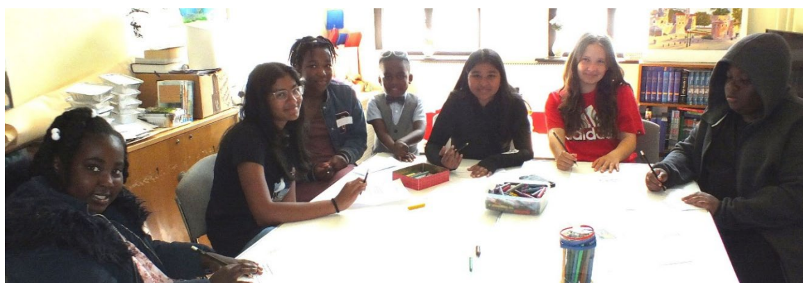
Figure 6: Some of our children in Junior Church

We feel now the time is right to develop our teenagers further by giving them a role to play in church life. There is at present no regular evening or mid-week worship although both of these have been run in the past.