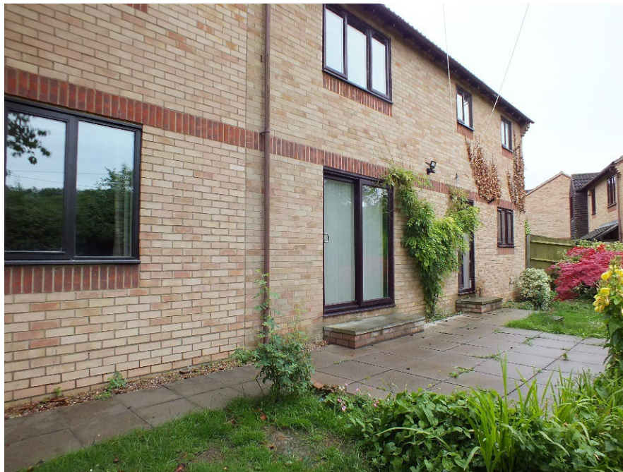
Figure 20 – Rear Garden

The upper floor consists of two bedrooms and a box room served by a family bathroom, and large main bedroom with ensuite is above the study extension.