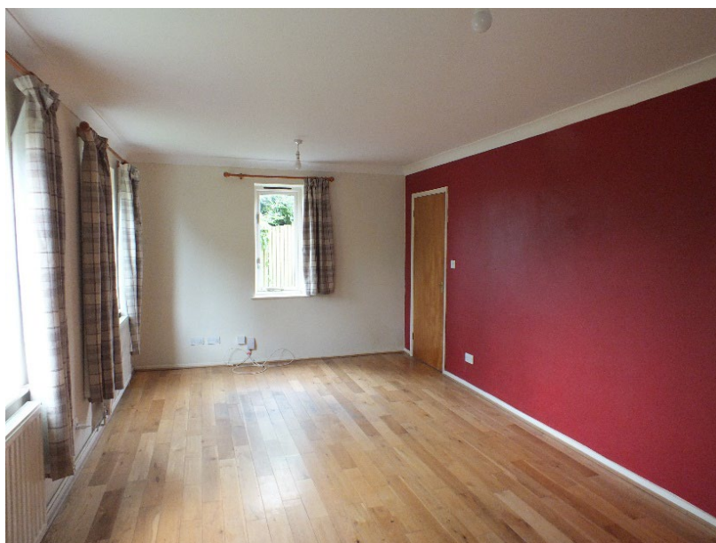
Figure 19 – Study extension

An extension was added about 20 years ago to provide a study (figure 19), WC and separate entrance. This has been used as a second reception room and utility room with a garden gate installed, so that the former external entrance now leads to back garden. This arrangement is flexible and could be changed back to the original layout.