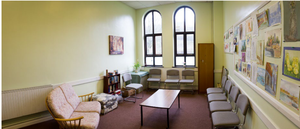
Figure 15: Small Meeting Room used by the Junior church

Our hall is very popular with regular bookings by an NHS clinic meeting twice a week and others groups such as Brownies and Rainbows, keep fit, children's ballet and a privately run youth group. Occasional hirers ask to use the building mainly for children's parties.