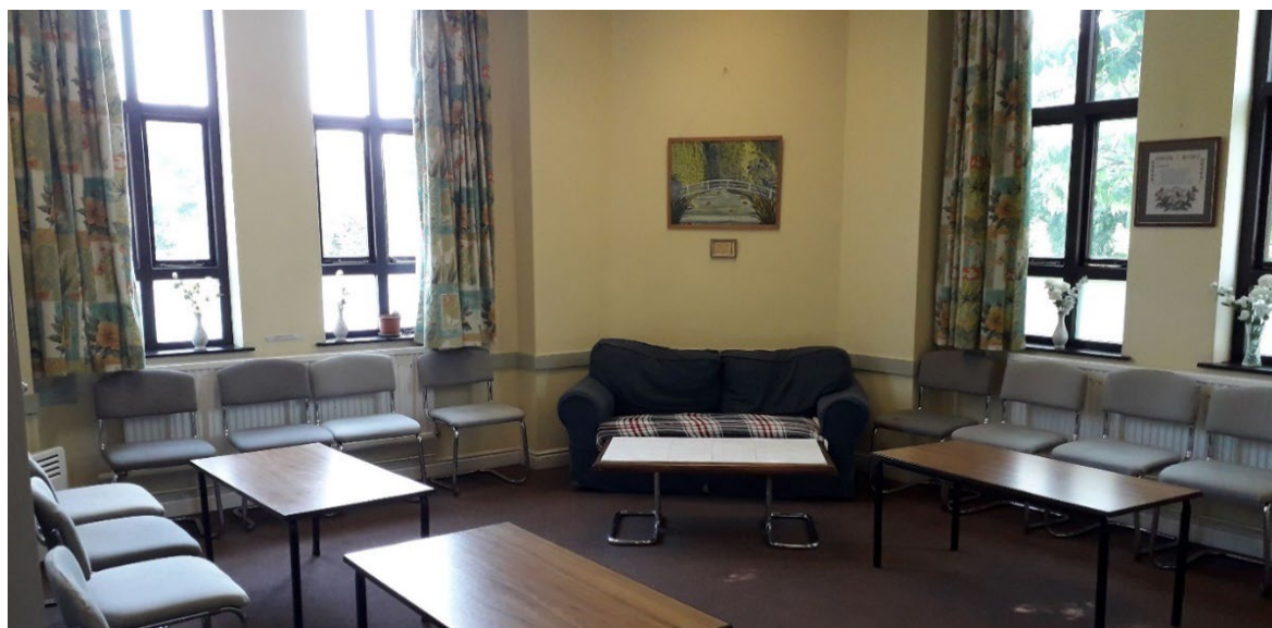
Figure 14: Large Meeting Room used for after service tea & coffees and also the PCC meetings

Further in there are two meeting rooms, a crèche, the vestry and a kitchen.