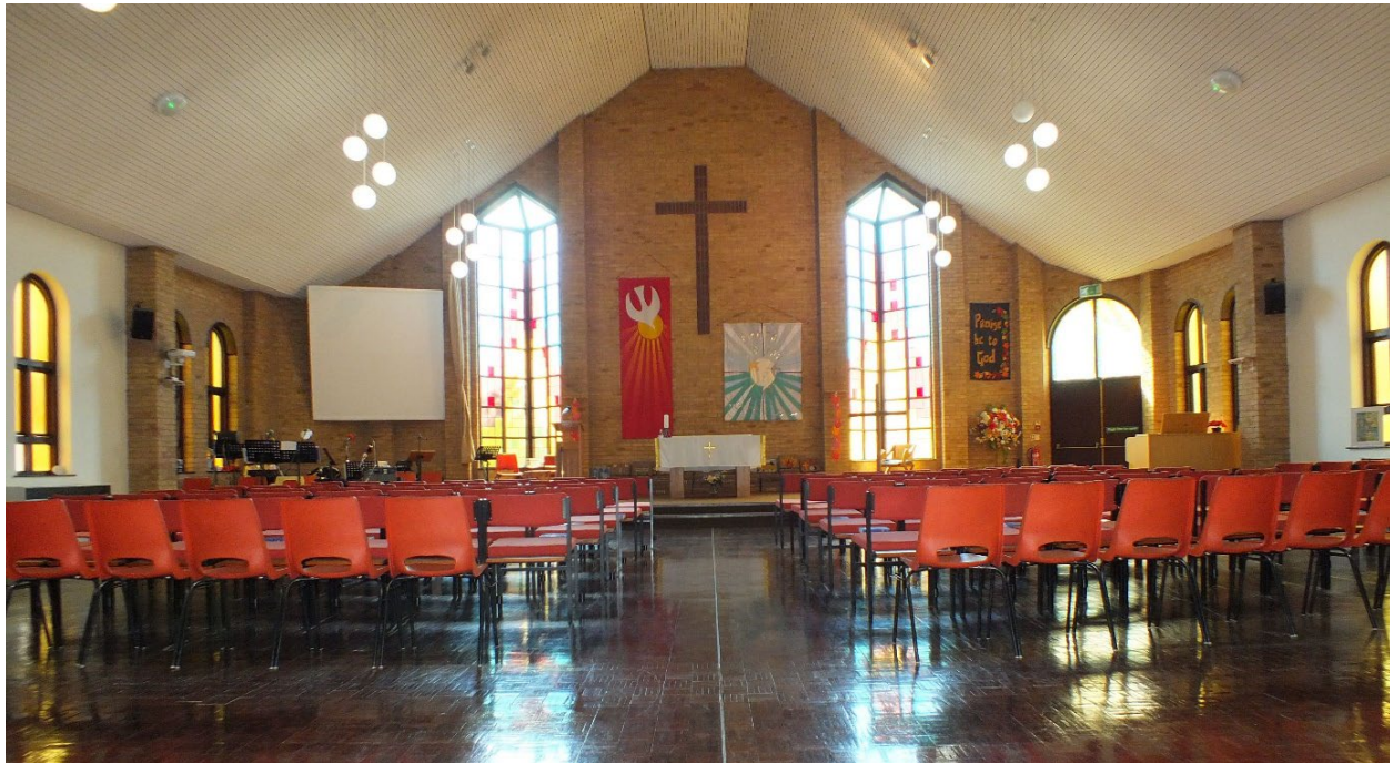
Figure12: The Worship area

The Church building was completed in 1991 and we celebrated our 30-year anniversary in February 2021 during the Covid pandemic, the bishop linked up with us via zoom! The Church is set on an area of lawn which is adorned with wild orchids, flowers in season, shrubs and bushes, with a secure fenced area for children's summer time activities. Alongside the entrance our young people have created a sensory garden.