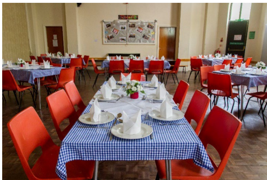
Figure 13: The Hall Set up for a Meal

We have our own small car park and are able to use Morrison's car park opposite both of which are free to use. The interior incorporates a generous entrance/reception area that contains the church office, ladies, gentleman's and disabled persons toilets, the latter incorporating baby changing facilities.