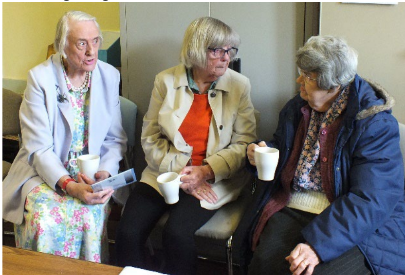
Figure 7: A cup of coffee and a friendly ear

A significant element of our services is a short time given over to allow individuals to share any blessings they have received during the past week or to ask for prayer support for troubling things.