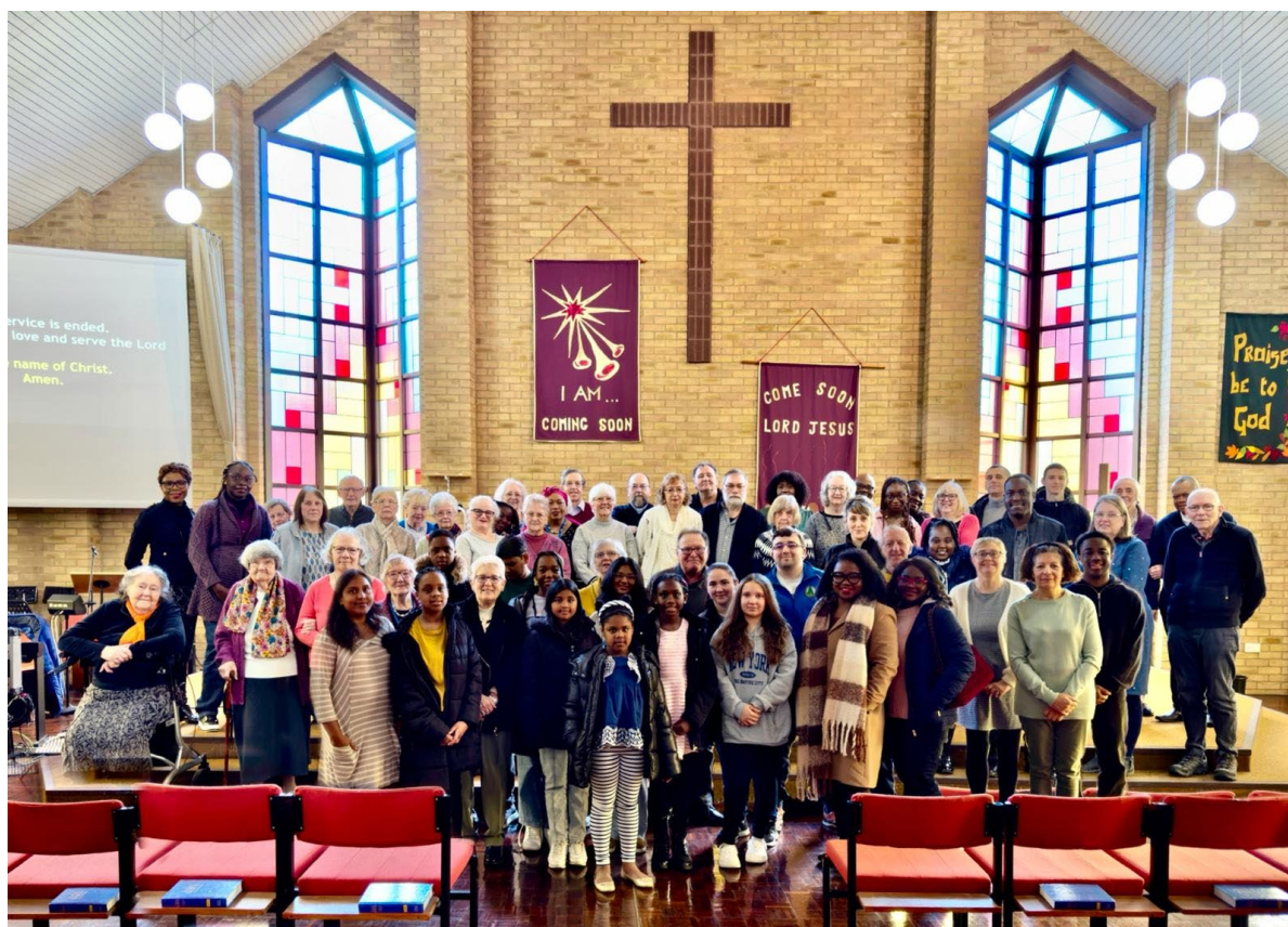
Figure 4 Church membership in February 2024

We are Christ the King. While we worship in a fairly modern building, we are not defined by it but have our own sense of “self”. Our congregation encompasses people with a wide range of age groups from new born babies to a member in their 90’s different backgrounds and education levels, and different economic and ethnic origin groups. We are a multi-cultural church, welcoming all ethnicities, with a wide range of ages. We have an increasing proportion of African-Caribbean and other Multi Cultural members as well as an increase in families with school aged children which has changed the make-up of the church. We recognise this requires us to change our structure and style if we are to cater for our current and possible future congregation.