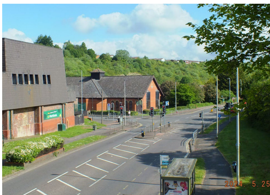
Figure 11: Christ the King, Princes Park viewed from the high-level bridge crossing Princes Avenue

Within the same complex is a day nursery, hairdressers, post office/newsagent, pharmacy and public house with a doctor's surgery (opposite the church) also served by the supermarket car park. There is a bus stop directly outside the church gardens with the main town (Chatham) 3 miles away.