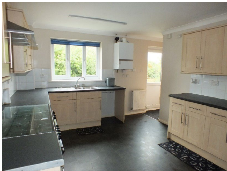
Figure 18 – Kitchen Diner

To the right side of the lobby is the main lounge which has patio doors to the rear garden there is also access to the study.