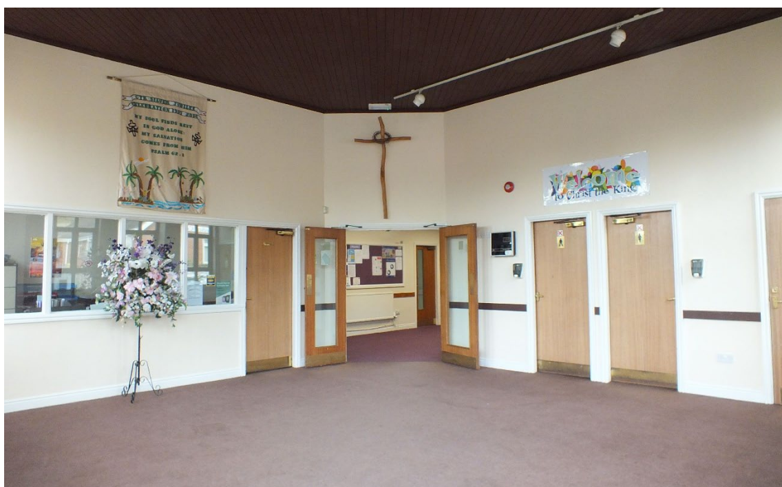
Figure 1: - The church entrance

Prayer is an important part of what we do and we work to ensure it is core to all of our activities. We have a prayer diary for all members and a small team that provides individual prayer for members of the congregation during and after the 10 am service.