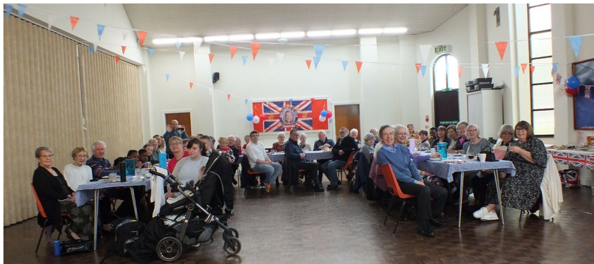
Figure 5 Celebrating King Charles Coronation

We serve tea and coffee after the service in the larger meeting room to bring people together socially. In addition, we run a small number of social events to bring us together but still want to do more.