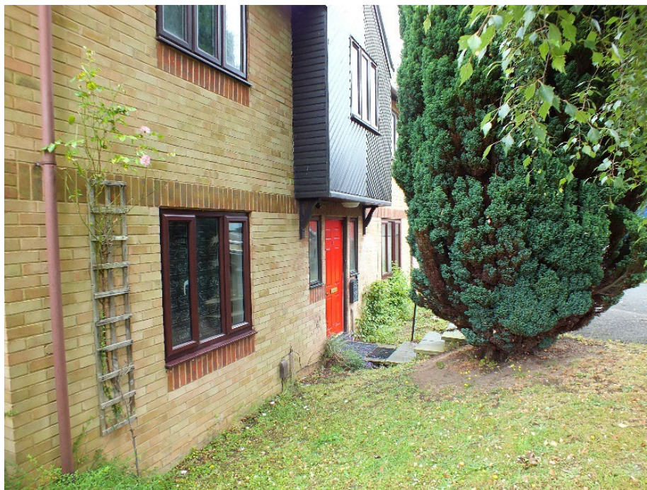
Figure 17 – Vicarage main entrance

The vicarage at Thrush Close is a 10-minute walk away from the church and is situated on a housing estate built around the same time as the church. The house has four bedrooms which includes a small box room.