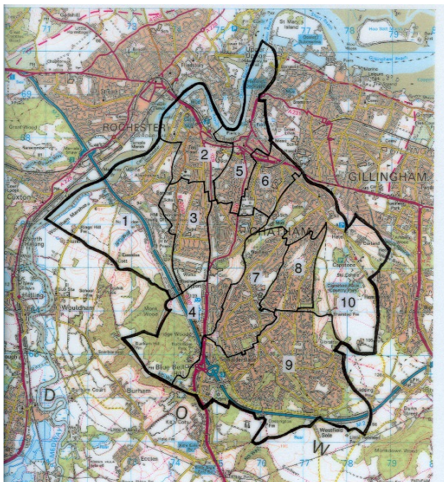
Figure 3: Deanery Map – Christ the King is No 8

The deanery comprises ten parishes, which include one Team ministry