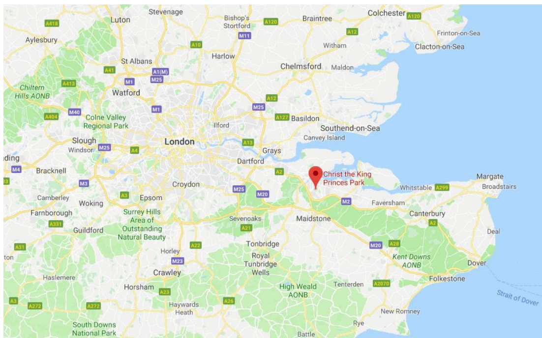
Figure 10: Christ the King location map

In common with Kent, Medway has retained selection at the age of 11 and has several Grammar schools within its boundaries. The vicar of Christ the King has previously served as Governor of a local (non selective) school with that school also frequently using the church for services such as Harvest and Carol Services.