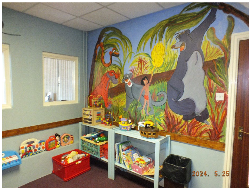
Figure 26: The Creche

The building itself is in a general good state of repair. We believe we have a building that is a blessing to us and the local community that we are trying to serve.