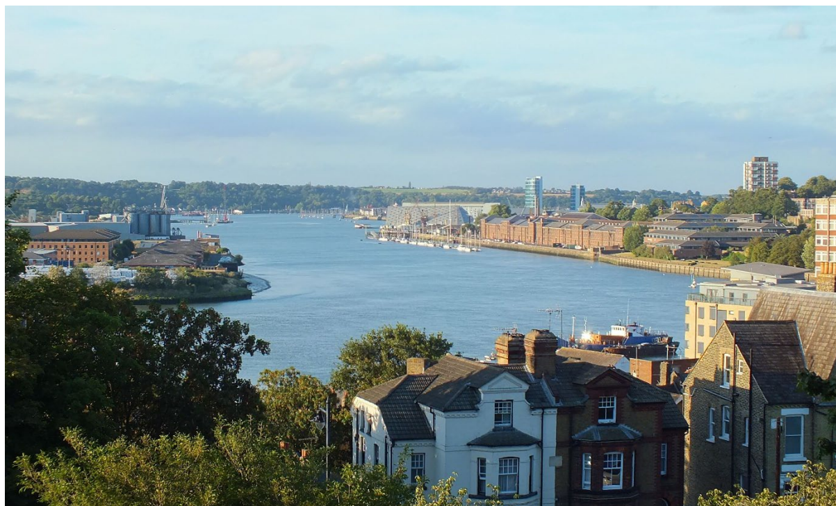
Figure 2: - The River Medway looking towards the former Royal Dockyard

The boundary of our deanery is that of the old City of Rochester and borough of Chatham, both part of Medway. The river Medway forms the western boundary.