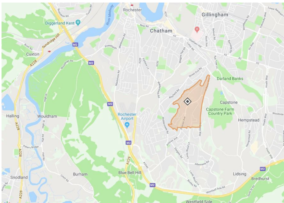
Figure 8- Parish of Christ the

The parish of Christ the King, Princes Park was created in 2007, having been a church plant of Christ Church Luton and is situated to the south of Chatham town centre. Chatham along with Rochester, Strood, Gillingham and Rainham form the Unitary Authority of Medway.