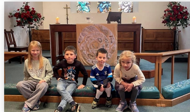
Some of our Children's Church members