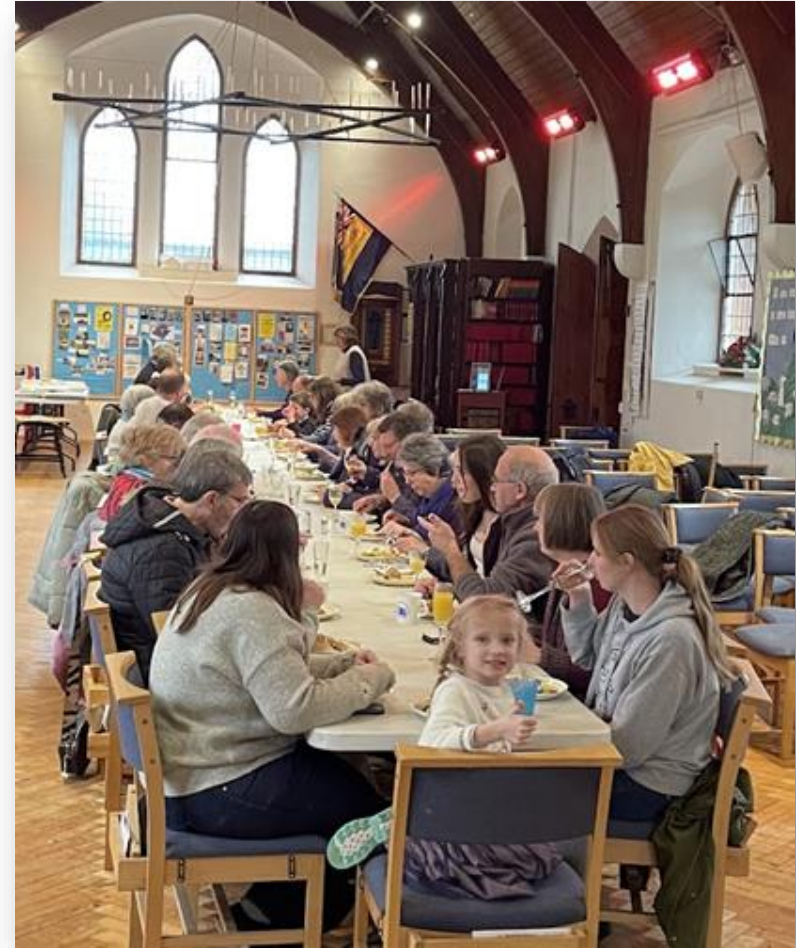
In January 2026, we celebrated our 120 th anniversary with a special service and bring & share lunch.