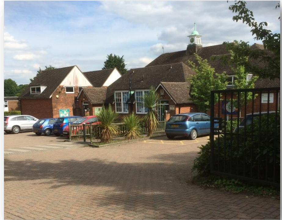
Borough Green Primary School

Grange Park School is also situated in the north of the village and provides specialist provision for children and young people aged between 11 and 19 with an Autism Spectrum Condition (ASC).