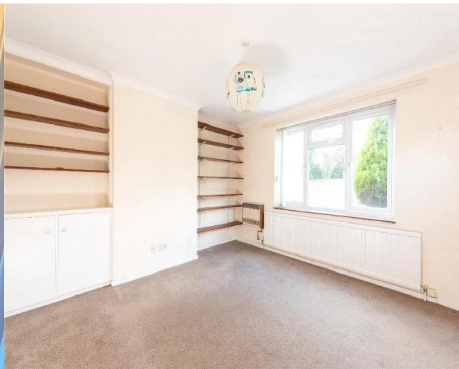
Great Linford Vicarage is a four-bedroom detached house.