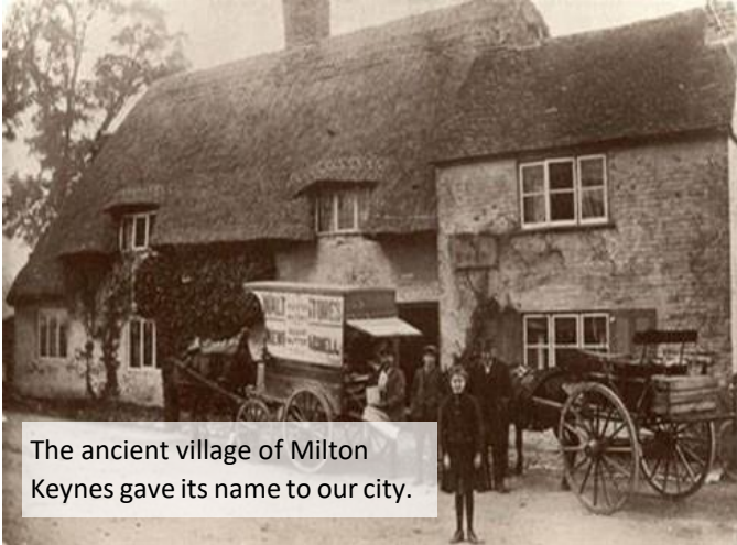
The ancient village of Milton Keynes gave its name to our city.