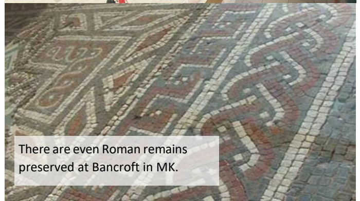
There are even Roman remains preserved at Bancroft in MK.