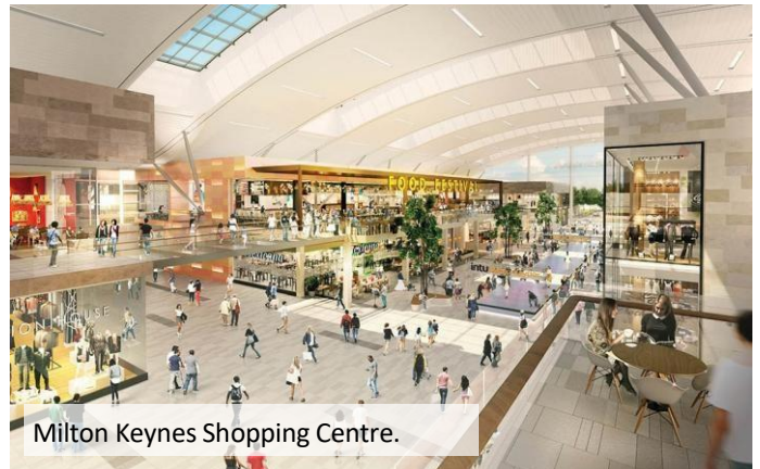
Milton Keynes Shopping Centre.