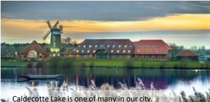
Caldecotte Lake is one of many in our city.