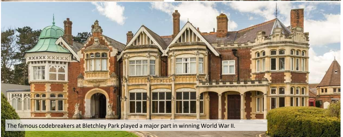
The famous codebreakers at Bletchley Park played a major part in winning World War II.