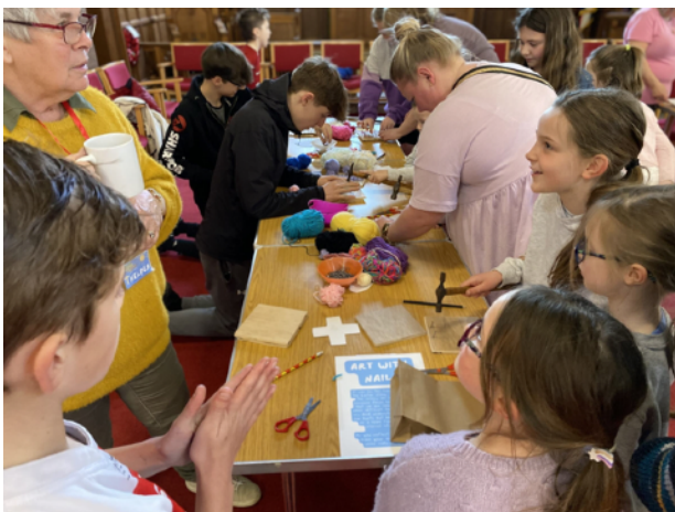
"The Good Good Friday Service" 2024

Occasionally, (especially around major festivals) we offer one-off cafe-style worship services which are always well-attended. Our Kid's Church began at the start of 2022 and have a number of regular families and many occasional families who now rely on our weekly children's provision. Our average attendance currently stands at 57 adults and 9 children. We have a number of home groups, some online and some in person, though in practise almost all of the midweek groups in our team are open to and enjoy members from all churches.