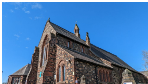
St Johns Church and community centre on Crossley Road, WA10 3ND

The building is a traditional Victorian-era church with a modern, attached community centre. There are areas of the building that need repair and investment, not least our roof which is original. Generally however, most of the building is in good repair and is an attractive Grade II listed structure. The church features striking stained glass, a traditional layout of pews, an attractive and working pipe organ alongside an appealing side chapel and a comfortable enclosed reception area and creche. It has a new and powerful video projector system installed alongside a sound system with the capacity to accommodate Sunday worship and small-to-medium sized music groups.