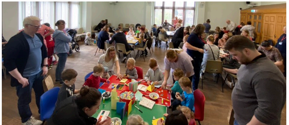
Easter Crafts event hosted by our Team Toddler Groups each year.

Across our team of churches we have three weekly toddler groups and we work closely with and support one in a neighbouring parish. Our toddler groups have been operating for many years as a team by sharing and making resources as a team, following the same curriculum, and meeting termly to pray together and share stories. All our toddler groups are places where families come for tea, toast, free-play and friendship. Most of our volunteers are committed members of the church and do their utmost to build supportive relationships with the families and to provide a witness to our faith. We begin our sessions with prayer, offer prayer throughout and there is always a bible story and nursery rhymes at the end.