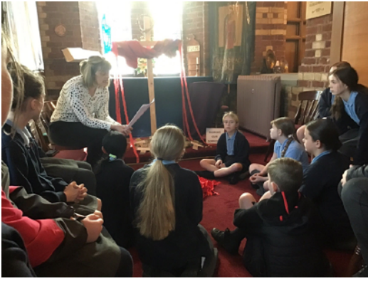
Children at the Cross station at our recent Easter Journey

We're inspired by words from Psalm 74: "We will not hide these truths from our children... we will tell the next generation about the glorious deeds of the Lord, about his power and his mighty wonders."