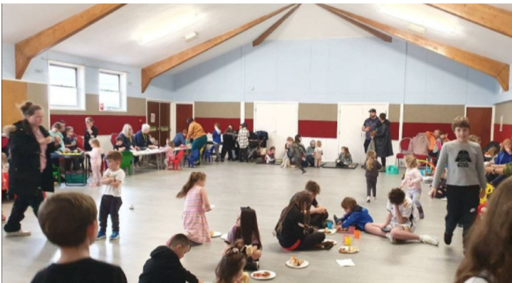
Family Fun Event in the Community Centre 2024

We have a community centre which can be accessed independently. In 2023 it underwent a redecoration, following some issues with flooding. Now it is reopen it is well used by the community. It consists of a large hall, two smaller meeting rooms and a fully functioning kitchen. We have toilets facilities including one with disabled access, and baby changing facilities. At the front of the centre we have an Eco Garden which we want to encourage the