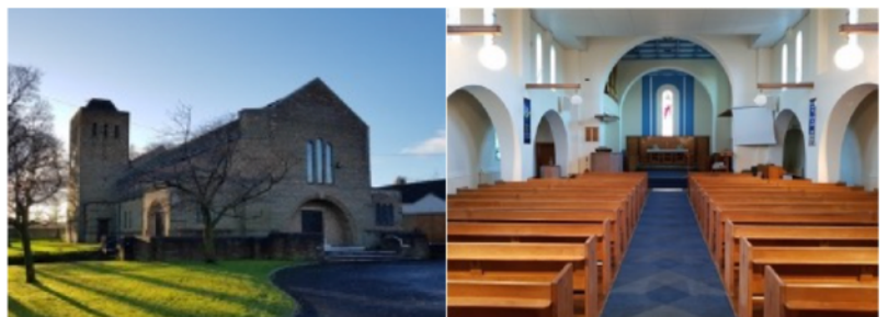
St Matthew's, Thatto Heath

Every other week we have children's provision in the lounge at the entrance to church, with crafts and a story. In the recent past our church community has had good success hosting cafe style services once per month, and pop up messy style services at St Matthew's.