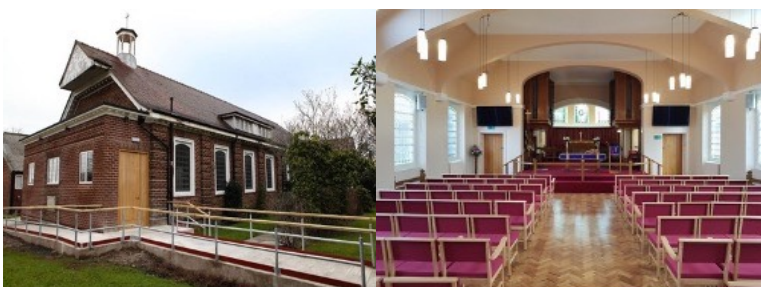
St James, Eccleston Park

was situated on and with the proceeds we plan to invest in St James building in a number of ways (making it more comfortable, and increasingly attractive to renters) and we plan to rejuvenate the St Matthew's church and centre so that it can truly serve the people of Thatto Heath.