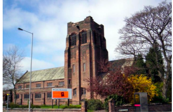
Our church is prominent, and located on Knowsley Road WA10 4PU

Our church building was opened just over 90 years ago, and is in good repair. About 15 years ago it was re-ordered and the pews were replaced by chairs. This means that we now have an open plan church giving flexible space to accommodate different styles of worship and opportunities for other events such as our Family events. It's also occasionally used for conferences or music events. We're blessed to have high quality audio and visual equipment (and a great team) which means we can live stream our services. There is also a side chapel, a Parish Room which is a small meeting room, a Lounge with a small kitchen space towards the back of church and a toilet to the side. In the entrance porch to the church there is a Smart TV to use for Welcome notices. We have a small car park at the front of church, and the grounds are maintained by a team of dedicated volunteers.