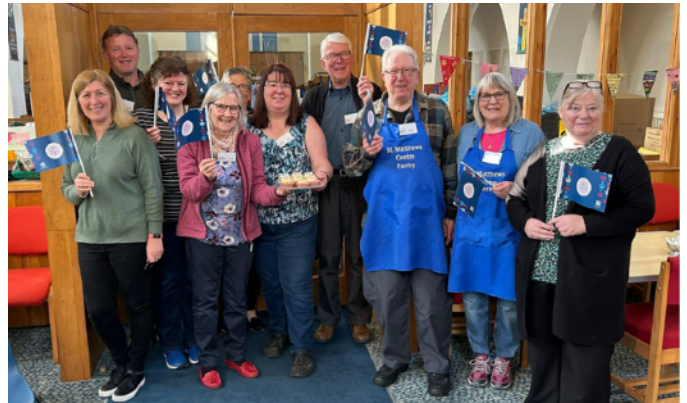
Just a few of our many food pantry volunteers across the team.

Our Team has two busy and thriving food pantries, located at St Luke's and St Matthews. Together, they serve hundreds of households every week, representing thousands of meals for local families and thousands of volunteer hours every year. This is our church's response to the cost of living crisis. Our pantries also dramatically reduce food waste, helping the environment. Our customers can access a wide array of support services through the pantry, as well as making friends and building relationships. This is a key mission field for our churches, and so as well serving people in the moment we use the opportunity to build friendships, make connections, invite to church and to special events and services. Our pantries work together, and work well with other local pantries and food banks, often supplying one another when someone is short. God has been incredibly faithful to our pantries, proving to us week by week that when we share, there is always enough for everybody.