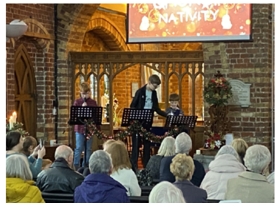
Some of our Children leading the Nativity Service December 2023

Our Kid's Church was developed at St Johns in April 2021 and has flourished since, usually welcoming between 10-20 children on a given week, and many more for special festivals and services. It particularly suits primary school aged children, and the church is currently developing plans for some structured youth provision. Following it's success the model was introduced at St Luke's at the start of 2022. The two Kid's Churches cooperate very closely, both follow the same curriculum and share resources with volunteers often preparing crafts and activities for one another.