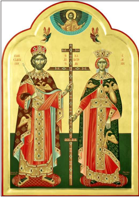
Ss Constantine and Helena

had been crucified, and a church was built on that site. Evelyn Waugh, the author of the famous “ Brideshead Revisited ” novel, which was also made into a TV series, also wrote a very different kind of book, simply called ‘ Helena ’ which is a historical novel account of Helena’s life. I read it many years ago and found it one of the most fascinating of all historical novels I have read, and I warmly commend it.