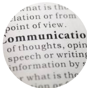
Vacant Communications Manager