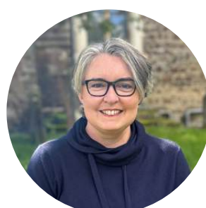
Brenda Beckett Women & Children's Minister