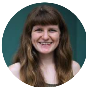
Sophie-Ann Rebbettes Children & Families' Minister