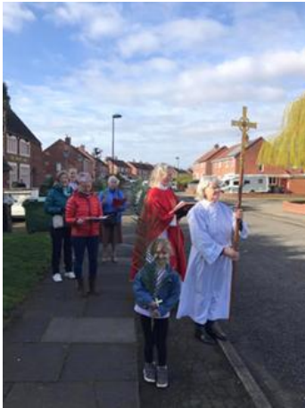
Palm Sunday Procession