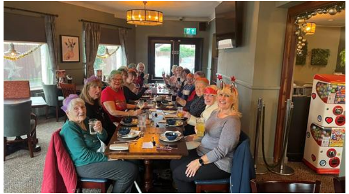
Care for a Cuppa Christmas Lunch