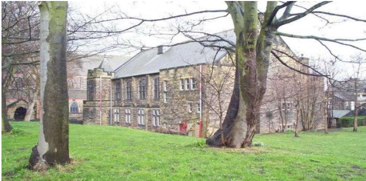
St Martin's Institute