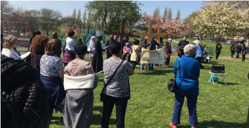
Good Friday Walk of Witness