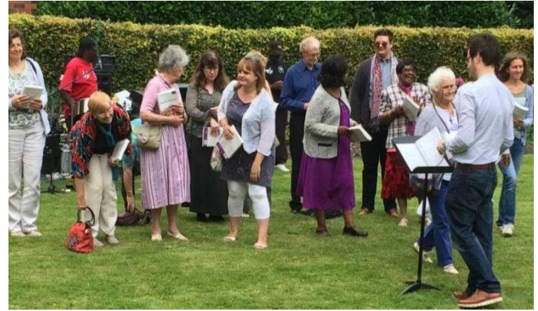
Choir on the Church Green

Since COVID, the number of attenders at the Sunday Parish service has been 40 adults on average. A significant proportion of the congregation is over 65. This includes members of the senior church leadership. The vast majority of church attenders live within the parish and the number of people on the electoral roll is 115.