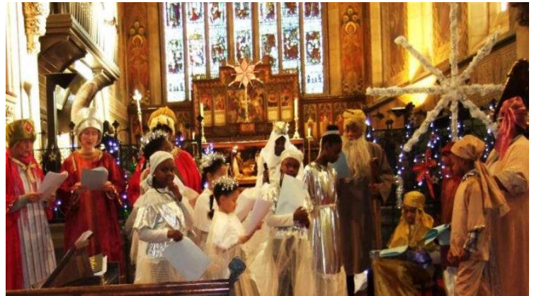
Christmas Carnival – Sunday Club