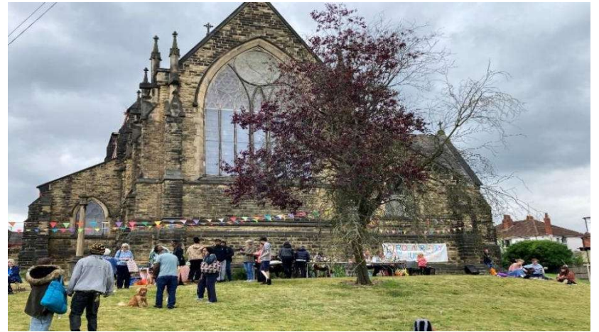
St Martin's Church