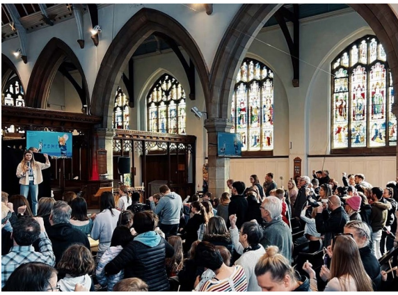
Worship in the Diocese of Lincoln

The diocese through its churches, chaplaincies and projects is deeply committed to the flourishing of the whole population and is embedded in every community across Greater Lincolnshire. Through, for example, our church growing schools children, young people and households we are committed to healthy, inclusive structures in society. The diocesan environmental policy, including a commitment to carbon net zero by 2030, informs all our work from buildings and investments to ministerial and faith training. We have a carefully implemented ethical investment policy for our historic assets. The diocese invests heavily in continuously improving the quality of our safeguarding performance.