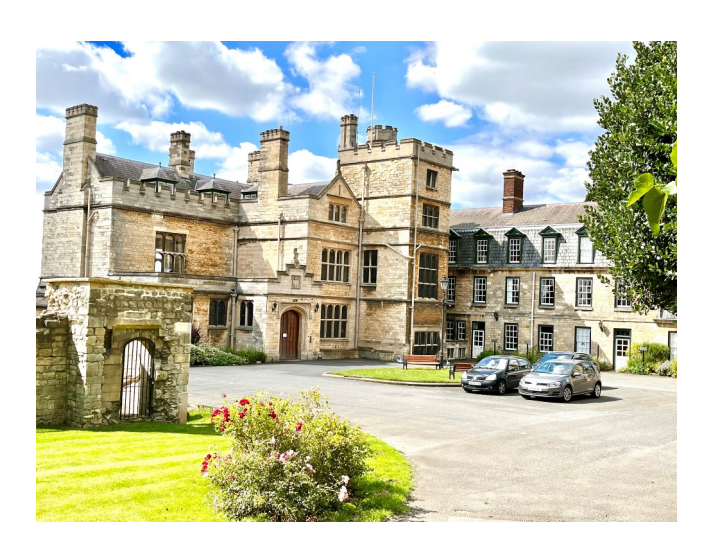
Edward King House

Our aim is to grow the Church, in both numbers and depth, through attention to what we see as our core tasks of faithful worship, confident discipleship and joyful service, with the vision of being a healthy, vibrant, sustainable church which leads to transformed lives and communities across greater Lincolnshire making a difference in God's world. To that end as a diocese we shall support, encourage and enable local parishes, schools and mission partnerships to fulfil, within this framework, their own unique calling to serve in mission the community in which they are set.