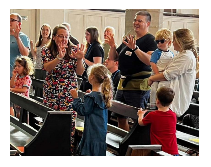
Worship for everyone at St Faiths in Lincoln

Time to Change Together, an integrated approach to growth, deployment, staffing, costs, investments, and voluntary giving launched in 2022, is starting to deliver major benefits in terms of working practice and support for our voluntary and paid staff in the parishes, and in levels of income and in care of our precious and vast range of church buildings, that they better