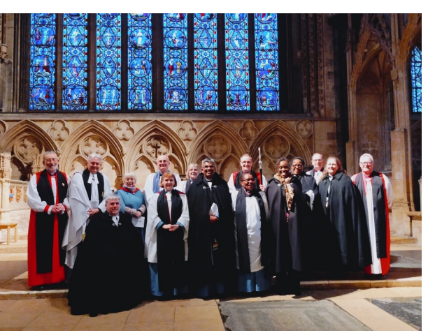
2023 Racial Justice Sunday service at Lincoln Cathedral