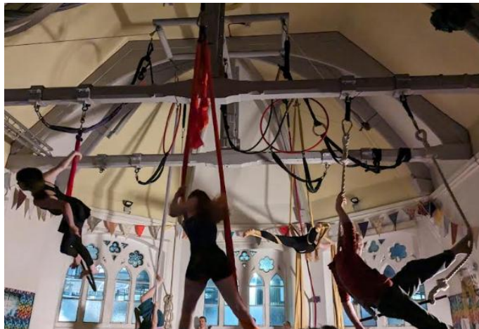
All Ways Good Company Circus Skills in Christ Church Hall

Christ Church Hall is hired weekly by several local groups: All Ways Good Company Circus Skills (three times per week); Bangshee Drumming Group (weekly); Newcastle Gamers Society (bi-monthly); and local Yoga Class (weekly).