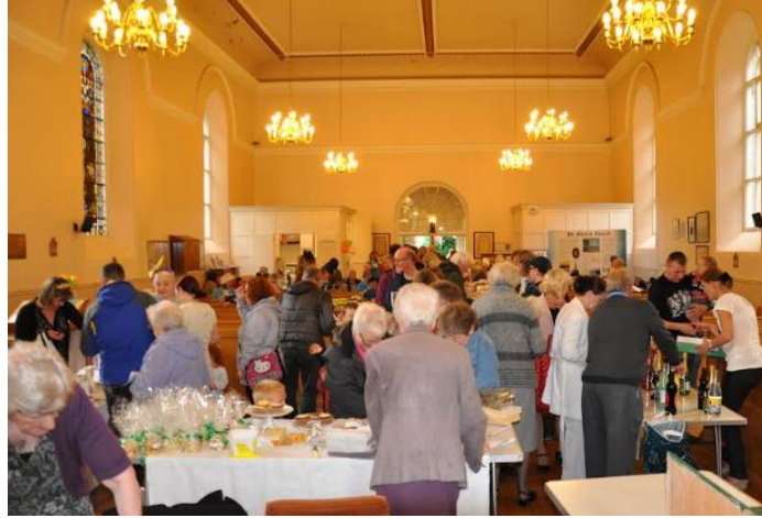
St Ann's Summer Fete

The Benefice has held a range of Bible study groups held at the Vicarage to help the congregation grow in faith. Men's Groups have also met to encourage social interaction through trips out for pub lunches, day trips to local attractions and film nights.