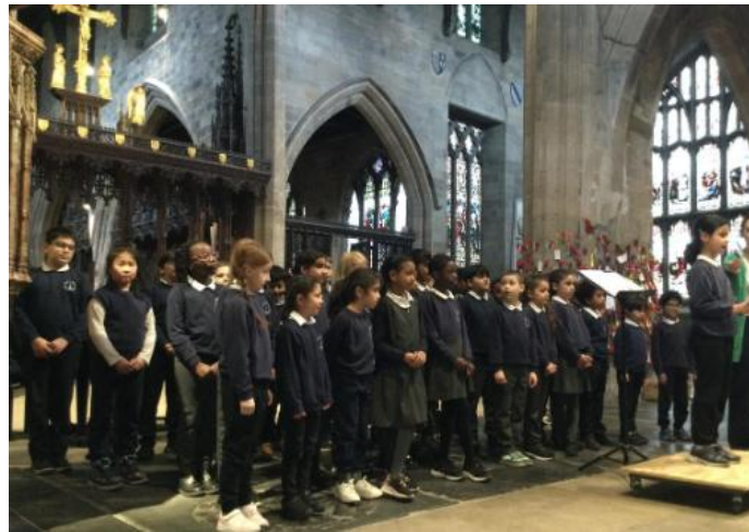
Christ Church Primary School performing at St Nicholas Cathedral

Christ Church Primary School adjoins the church and thrives on its diversity and is underpinned by Christian values, where everyone is welcome and valued. The school's vision is to shepherd each other in a safe, loving environment, whilst building a solid foundation to encourage and inspire each pupil to reach for their own star. The Church forms an important part of school life, with the Vicar attending weekly collective worship. Pupils also visit the Christ Church for special services and religious education. The Vicar will be expected to be appointed as a Foundation Governors to support the school and help shape its vision and oversee its operation. The school has around 130 pupils and received an Excellent SIAMs assessment in 2022 and has recently passed its OFSTED inspection and achieved strong standards in its inclusion and personal development and wellbeing performance rating.