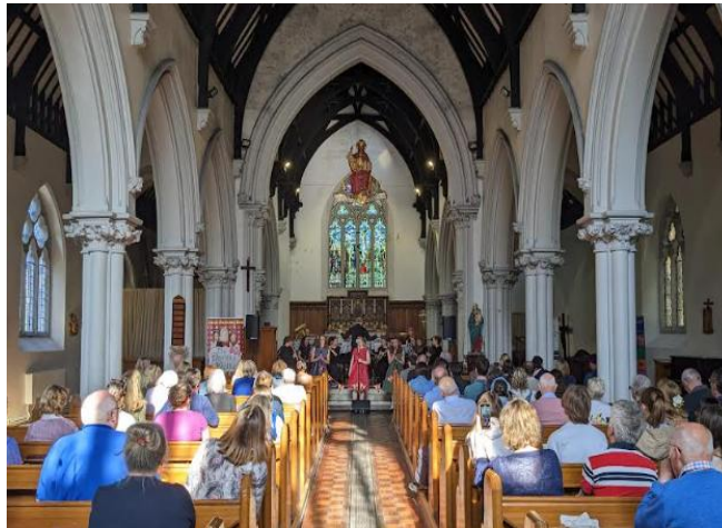
Newcastle University Wind Band Concert at Christ Church