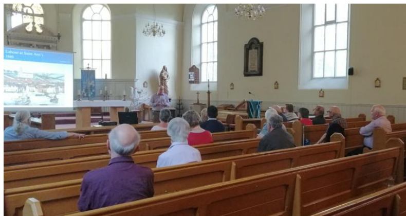
Lecture held by Friends of St Ann's

The Friends of Saint Ann works alongside the PCC in maintaining and enhancing the church and its churchyard. The activities of the Friends include dedicated events designed to highlight the historic and cultural significance of the church and attract visitors to ensure that the building continues to be a place of worship, learning, and enjoyment.