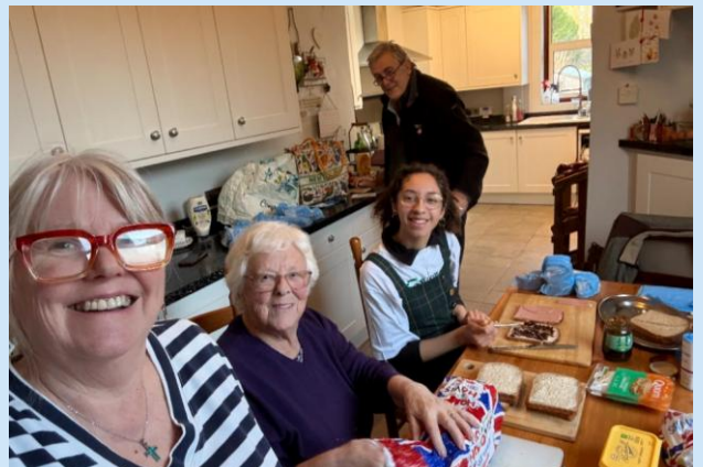
... and at St Augustine's