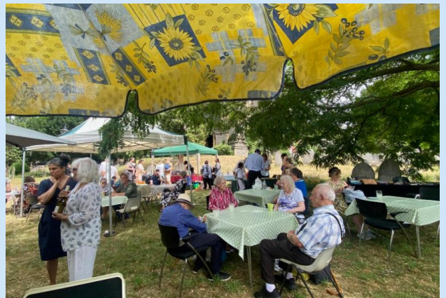
St Peter's Summer Fayre