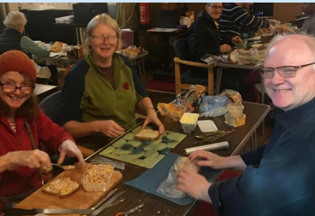
Sandwich making for the homeless, at St Peter's...