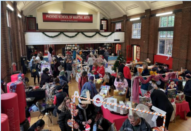
St Peter's Christmas Market

As a benefice we welcome the opportunity to worship together, bringing together not only our church congregations but also those of our ecumenical partners. Together we aim to make Christ known in South Croydon!