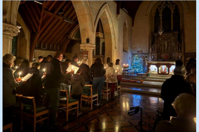
Benefice Christingle Service