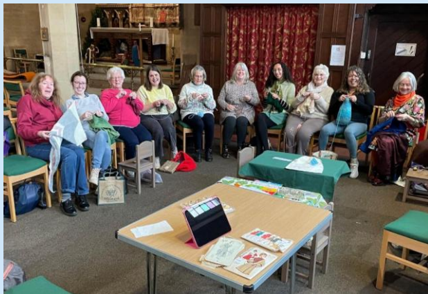
Knitting group at St Augustine's