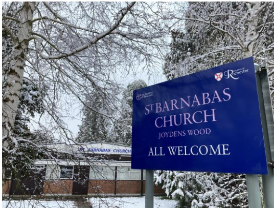
St Barnabas, Joydens Wood