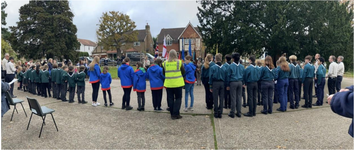
Remembrance Day 2021