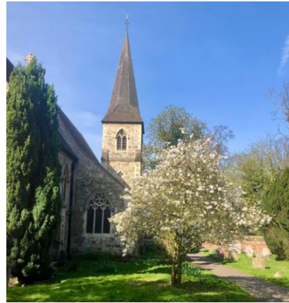
St James, North Cray