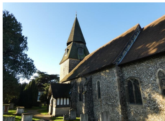
St Mary the Virgin, Bexley