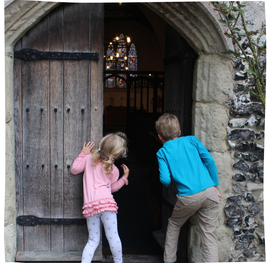
Cover image courtesy of Primrose Northrop