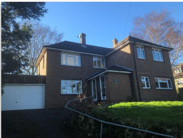
Vicarage front view

The vicarage is a short walk from the church and is accessed via a private shared access road. It is a four-bedroomed house with an adjoining garage set in a mainly lawned garden. Downstairs there is a lounge (with an open fire), kitchen/dining room (with separate utility room), study/office, cloakroom with shower and an orangery. Two of the bedrooms (including the master) have built-in wardrobes, one bedroom has a sink.