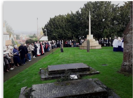
Remembrance Sunday at Holy Cross

The church is also the centre of significant events in people's lives with blessings of births, baptisms, marriages and funerals, and special services to celebrate marriage (close to Valentine's Day), Mothering Sunday and Holy Cross Tide. In 2023, there were 19 baptisms, unusually only two weddings, 14 funerals in church and 14 funerals at Maidstone Crematorium.