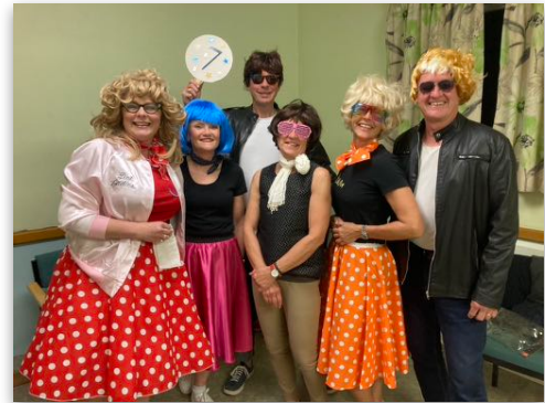
One of the Harvest Supper "acts"

This group also organises evening events, including the Maundy Thursday and harvest suppers and refreshments to accompany the APCM. They also ensure Holy Cross is represented at the carnival and other village events.