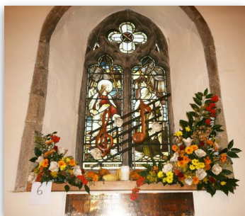
A church window dressed for the Flower Festival

The Raise the Roof Group organises fundraising events through the year, culminating in the annual Christmas fair in the church. These events are seen as outreach opportunities to people from Bearsted and further afield (this also helps to broaden the fundraising base).