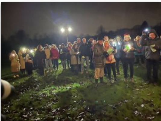
Carols on the Green

several times a year, including a service to mark the Week of Prayer for Christian Unity and for carols round the Christmas tree on the village green.