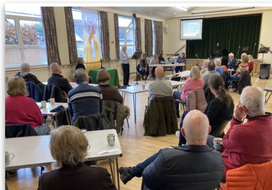
New Way service in the Memorial Hall

discussions, activities and contemporary worship songs led by a group of singers accompanied by a guitar or backing tracks. A typical congregation is 30–40 people. Occasionally,