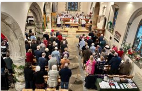
Holy Cross congregation Christmas Day 2023

There are currently 164 people on the electoral roll at Holy Cross.