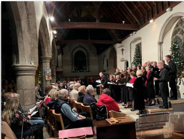
Mixed Blessings Christmas concert in church 2023

Villagers can enjoy many other activities/groups, which meet in church buildings or in the three community halls in the village. The