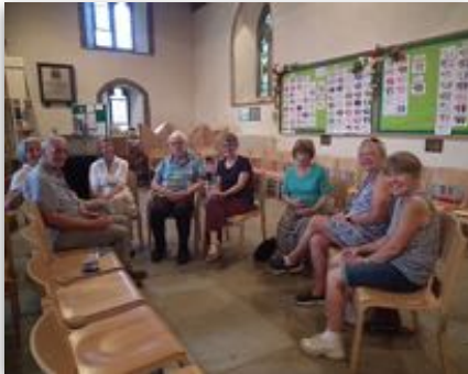
A group discussion in church

Our Home groups are a very important part of life at Holy Cross Church. Currently, around 50% of the congregation attend one of seven home groups in the parish. The groups meet weekly or fortnightly, mostly in people's homes, some during the day and others in the evening. Members provide support and encouragement for each other as they journey in faith, developing deeper relationships with God and each other.