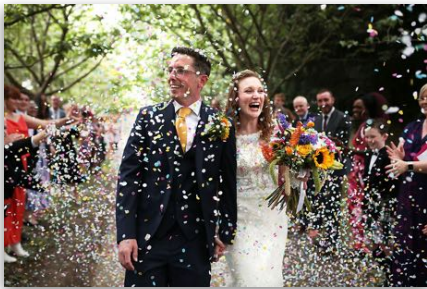
A wedding celebration

We hold an annual Remembrance Sunday Service attended by both congregations. We are joined by members of the local community including current and former service personnel who are invited to join the service and wreath laying at the war memorial in the churchyard.