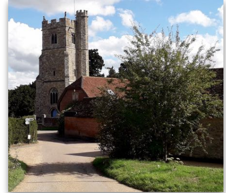
Holy Cross church tower

An extension to the church building contains toilets, a small kitchen, church office/clergy vestry, meeting room and choir vestry. Both the church and meeting room are regularly used by village groups. The church pews were recently removed and replaced with high-quality wooden chairs, which is helping to facilitate wider use of the church building.