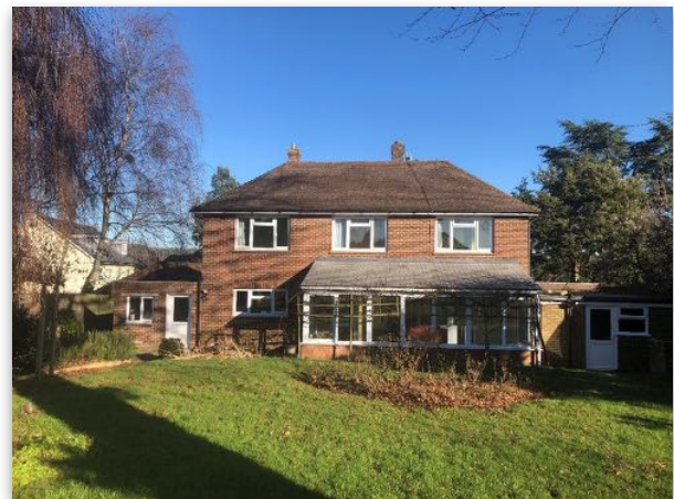
Vicarage rear view