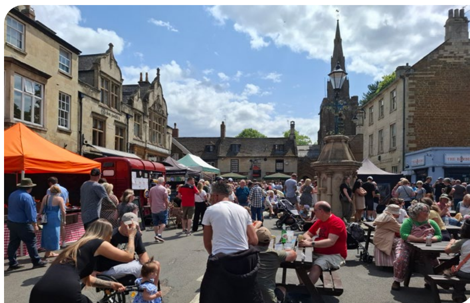
Uppingham's Summer Feast Day