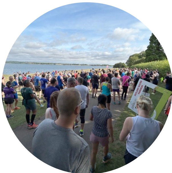
Nearby Rutland Water and its weekly Park Run