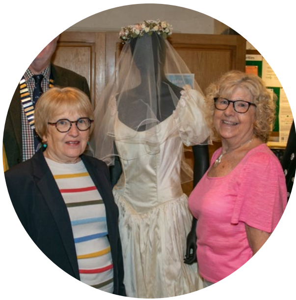
Wedding Dress Festival