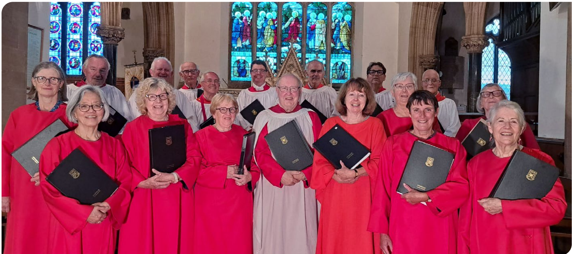
Uppingham Parish Choir