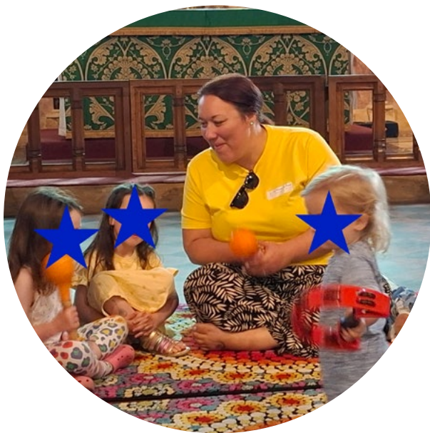
Little Fishes Toddler Group