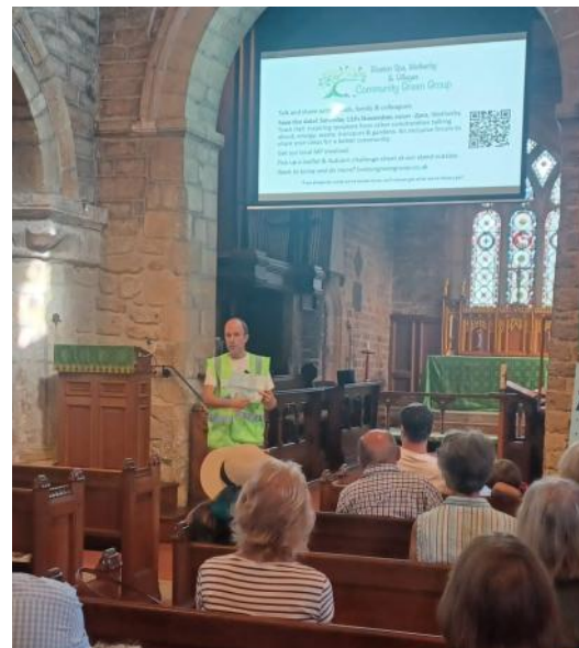
Sustainability presentation in All Hallows during the Green Fair