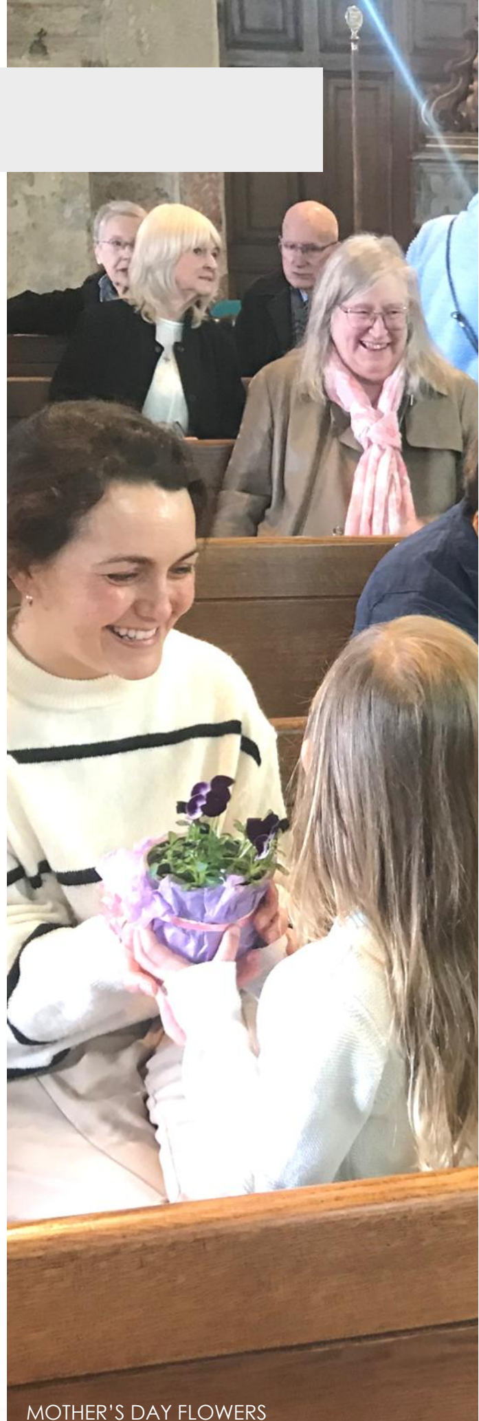
MOTHER'S DAY FLOWERS