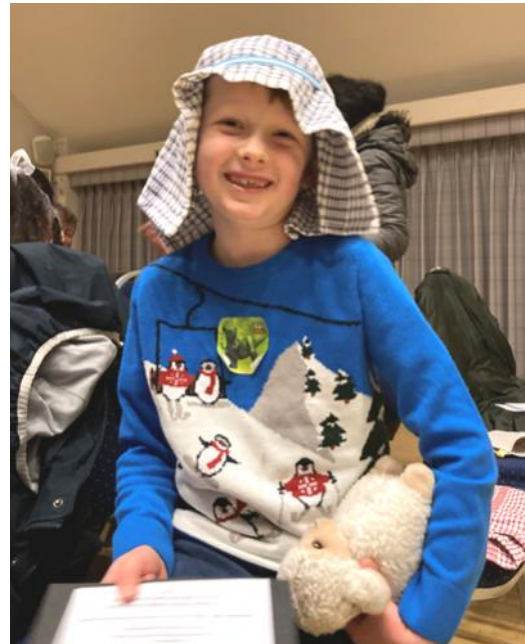
CT Nativity Shepherd

Association, Martin House Hospice, St Aidan's Food Bank, St Gemma's Hospice, Zarach, Baby Basics, and local families in need.