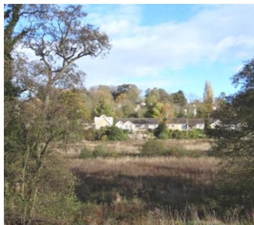
Bardsey Fields - A local community owned green space

There are many scenic footpaths and bridleways to enjoy and an array of village societies and sports on offer. There is a strong community spirit, which is exemplified in the support given to regular village events, held at the churches and village halls. The village primary school joined the local GORSE academy trust in 2023.