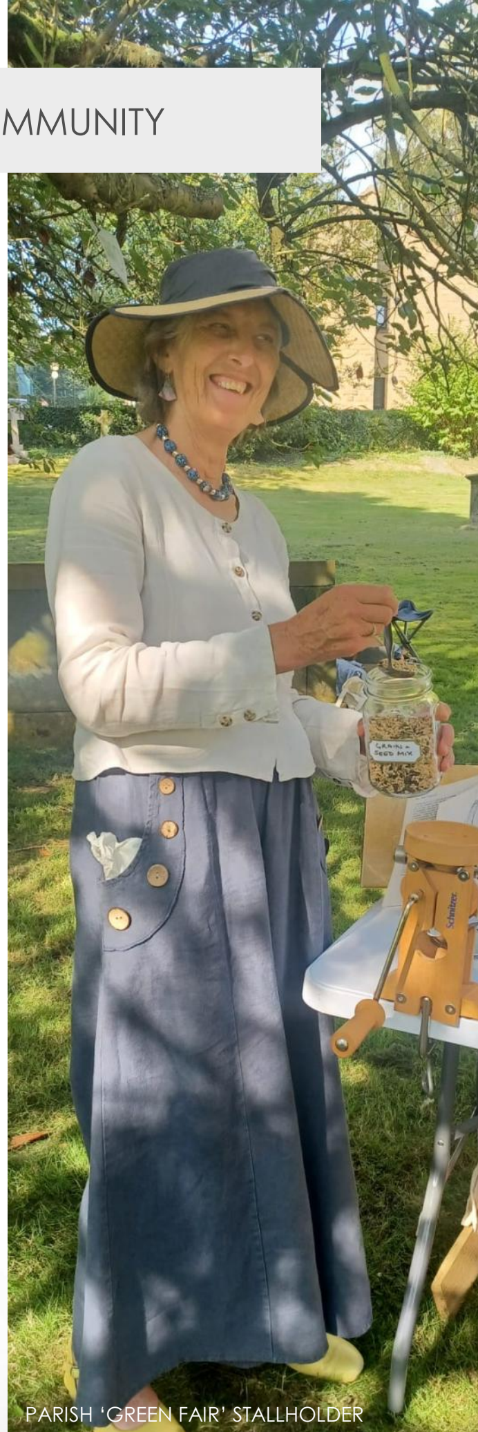
PARISH 'GREEN FAIR' STALLHOLDER

The Callister Café serves a monthly soup and pudding lunch to elderly members of the parish.