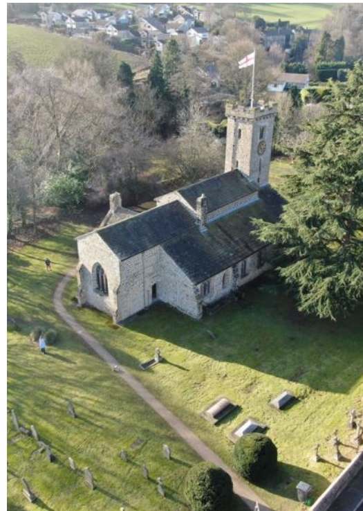
All Hallows Aerial View

The church is in sound condition and all urgent and essential works identified in the last quinquennial inspection have been completed. There is ongoing work in the churchyard, including the reparation of walls and tree maintenance. Our next quinquennial inspection is due in 2026.