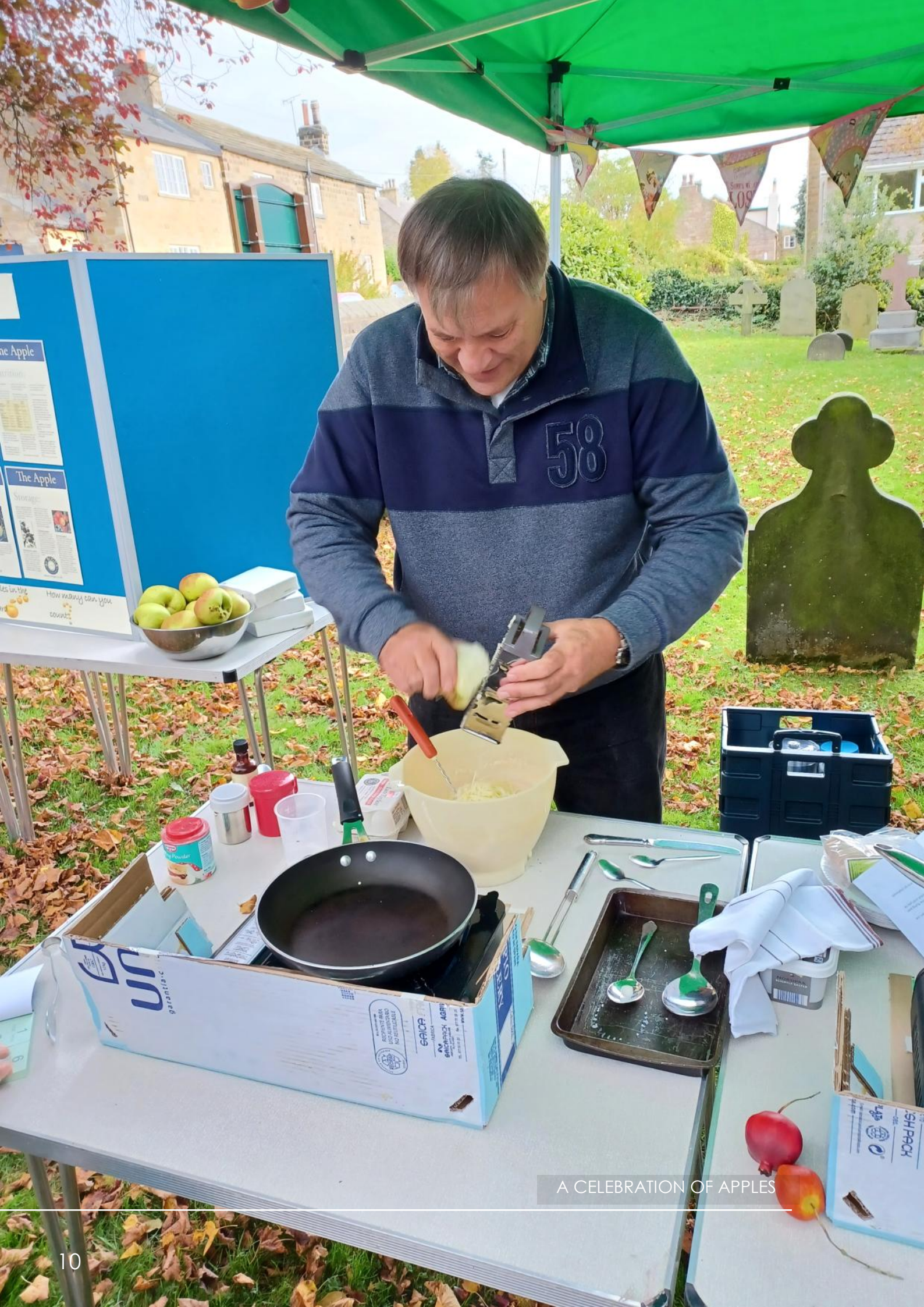
A CELEBRATION OF APPLES