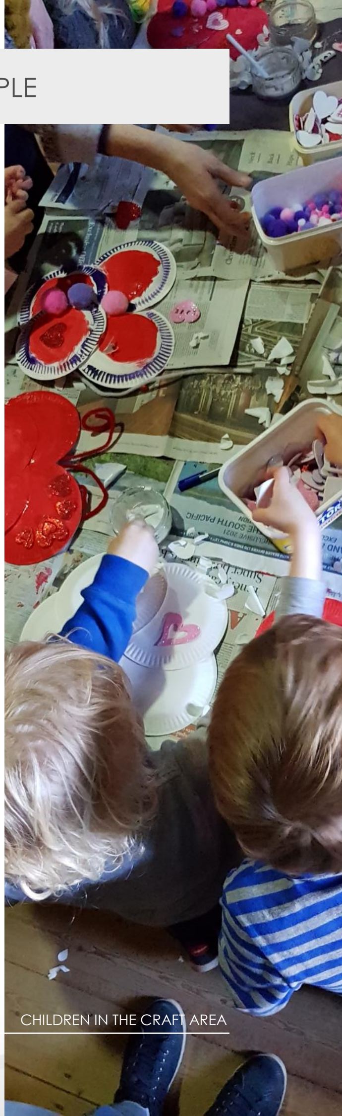
CHILDREN IN THE CRAFT AREA

We have a baptism coordinator and we keep in touch with baptism families and invite them to our family services and special events. We send cards to families on the anniversary of a baptism and all children baptised in church are given a knitted teddy bear made by parishioners.