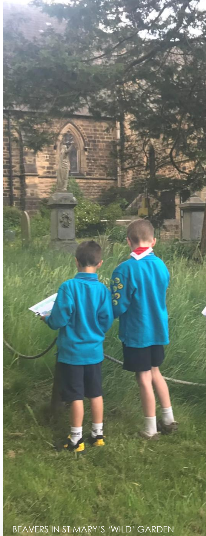
BEAVERS IN ST MARY'S 'WILD' GARDEN

Recycling hubs are provided in both churches for the benefit of the whole community. We are proud that both our churches hold silver A Rocha awards, and our eco work further encourages the local community to consider their impact on the local environment.