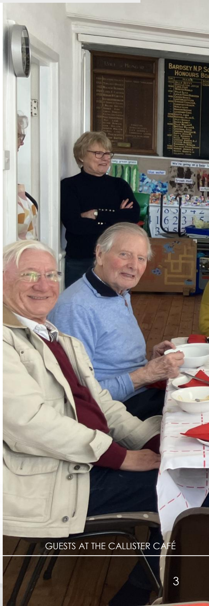
GUESTS AT THE CALLISTER CAFÉ

We will, of course, support our vicar in taking proper holidays and days off, as well as offering whatever support we can for their training, reading and wider personal development.