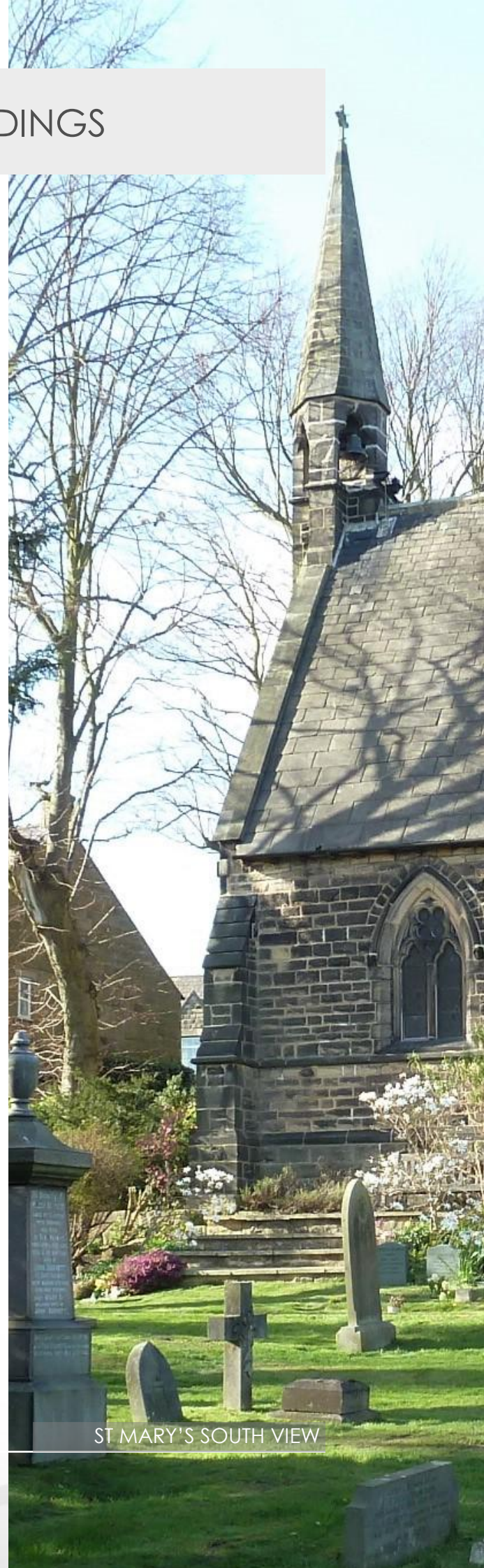
ST MARY'S SOUTH VIEW

The church is in sound condition and all urgent and essential works identified in the last quinquennial inspection have been completed.