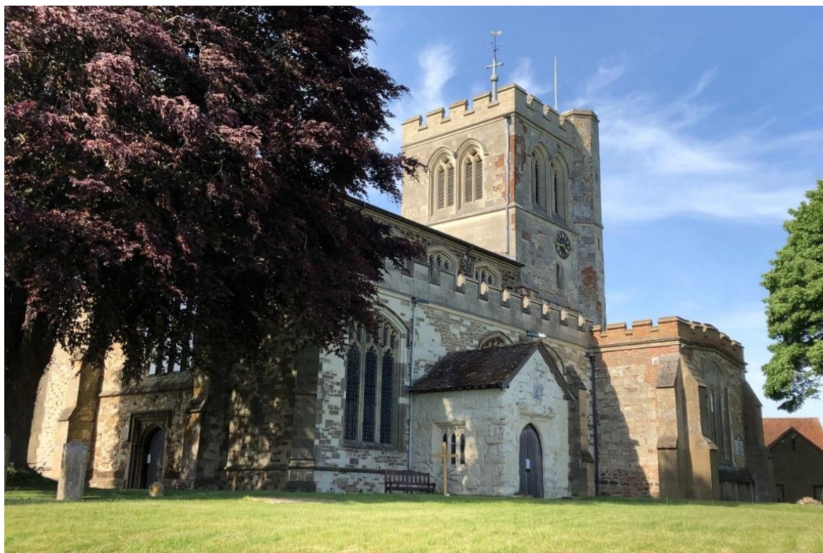
St George of England Church, Toddington