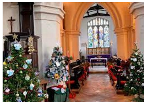
Christmas Tree Festival