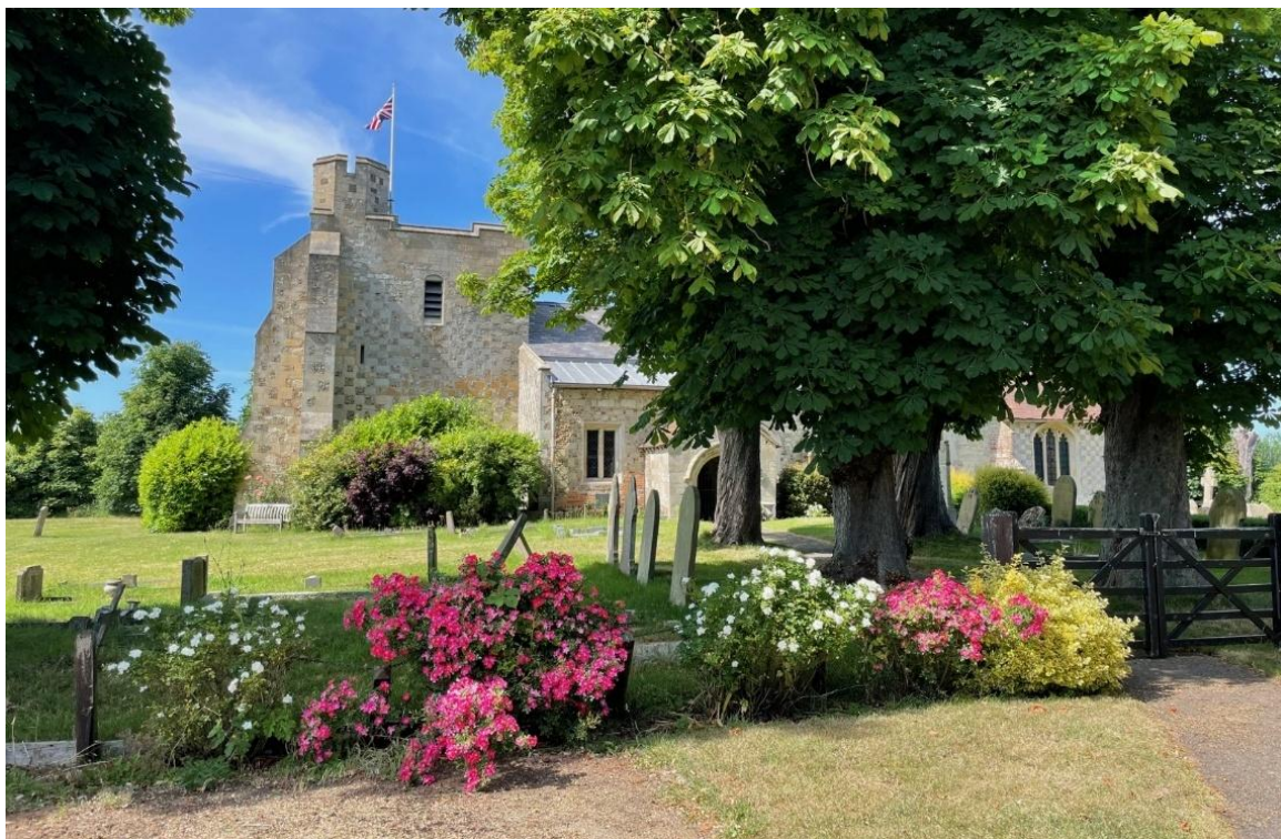
All Saints Church, Chalgrave