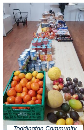
Toddington Community Fridge