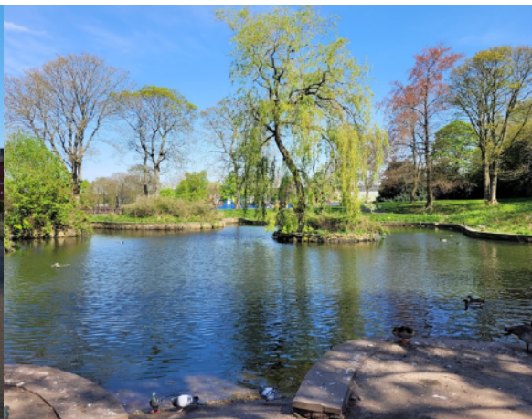
The Lake at Victoria Park