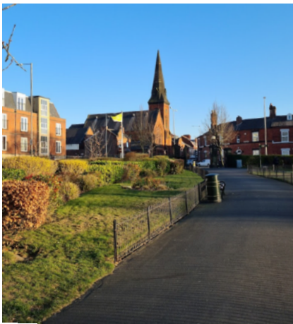
St Mark's seen from Victoria Park

The parish is an urban district with a moderate percentage of the population on a low to middle income. The parish is home to approximately 6500 people and 2500 homes. These are a mix of private housing, social housing and sheltered accommodation. This is expected to grow with a large new housing estate being built just behind the church. Our hope is that our church can make the most of this exciting opportunity and reach many new families in the area.