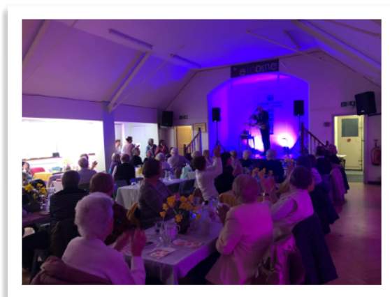
Music social at the Gamble Hall

St Mark's is up to date with its parish share (approximately £25,000 per year) and has a good payment record. Our total income last year was approximately £60,000 and our expenditure was £90,000 owing to building improvement works/repairs and Project Management costs. We're currently renewing our contracts with all our hall users and renters to help ensure the longer-term financial viability.