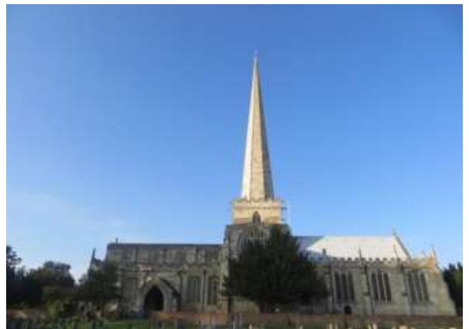
St Mary's Hemingbrough