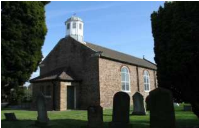
All Saints Barlby