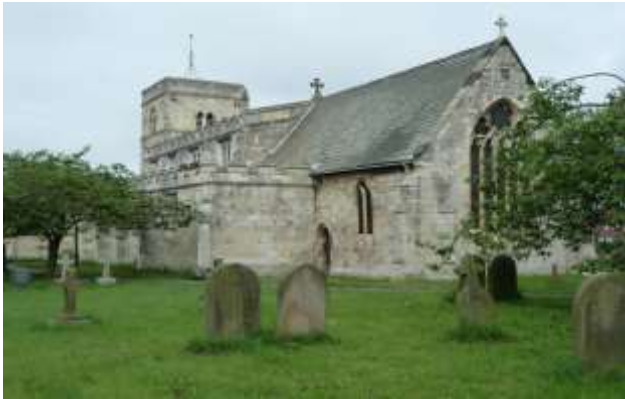
St Mary's Riccall