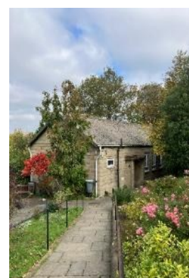
The garden path