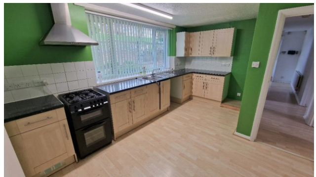
Clockwise from top-left: A bedroom, the master bedroom, kitchen and utility room.