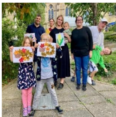
Showing our work!