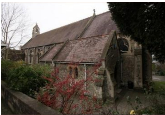
St Matthew's Church

St. Matthew's will be due a new quinquennial report in 2026, but the church has been well maintained, and its needs are looked after by its PCC. The last quinquennial report showed the church to be structurally sound. It needed works to be done on the roof, and this was completed in 2023. The need for a Parish room resulted in an extension to the Church. Completed in 2000, its cost of £46,000 having been raised from fund-raising, donations, and bequests.