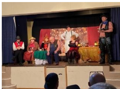
Production in Cleave Warne Hall