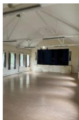
Cleave Warne Hall