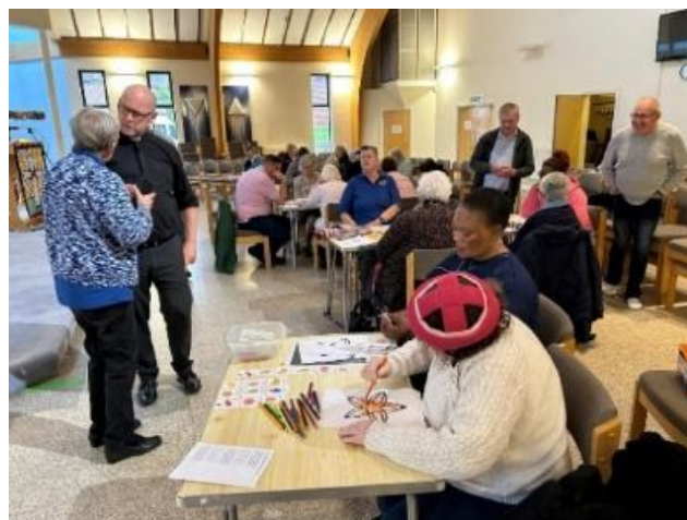
Dementia Worship at St Justus