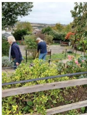
Working in the garden

Cared for by six volunteers, the gardening often coincides with the Downs Syndrome group (mainly adults), who appreciate seeing what the gardeners are doing and, at times, interacting with them.