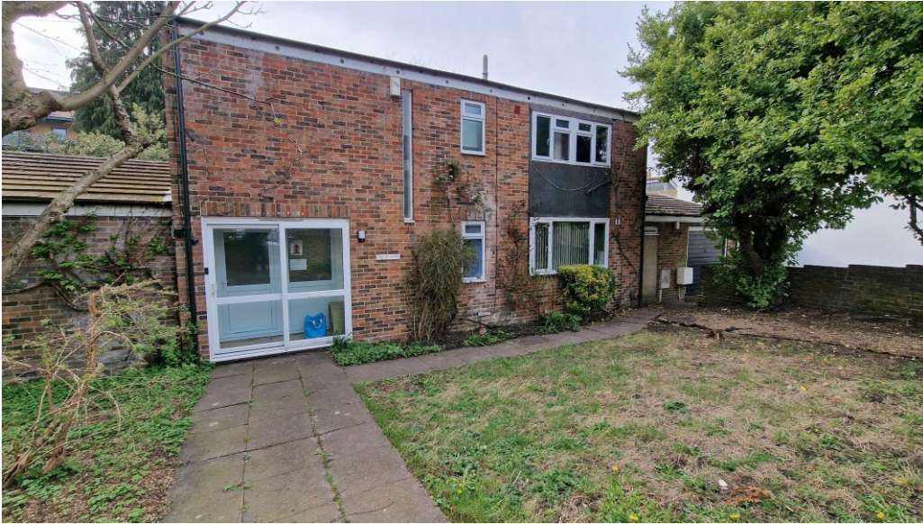
A view of the vicarage from the front