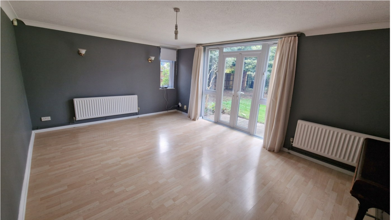
The Sitting Room