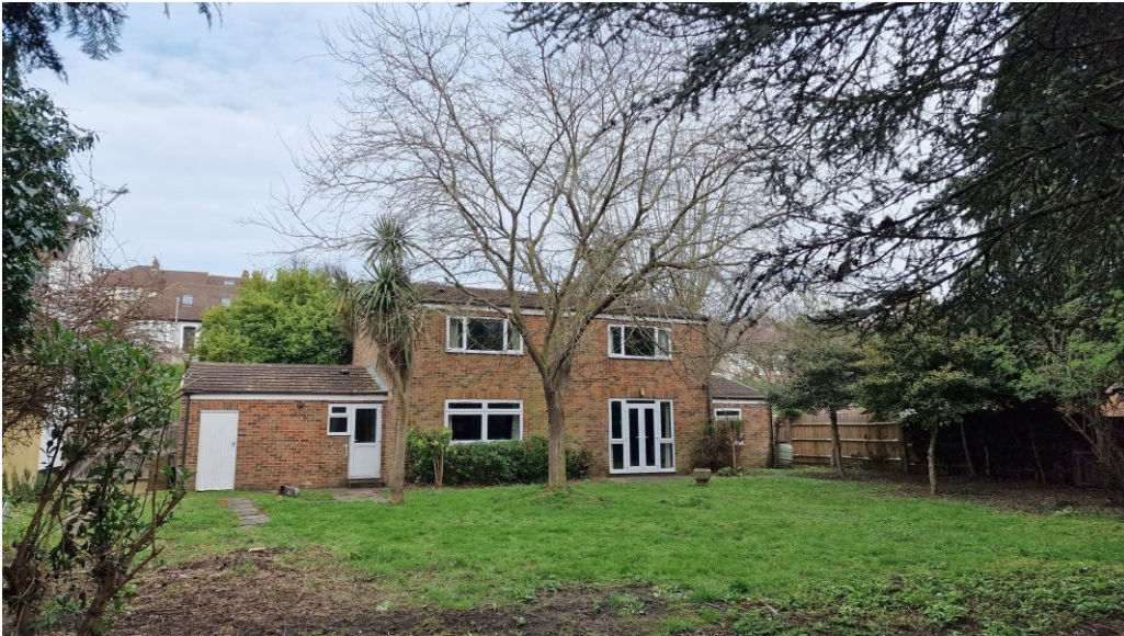
A view of the vicarage from the rear garden