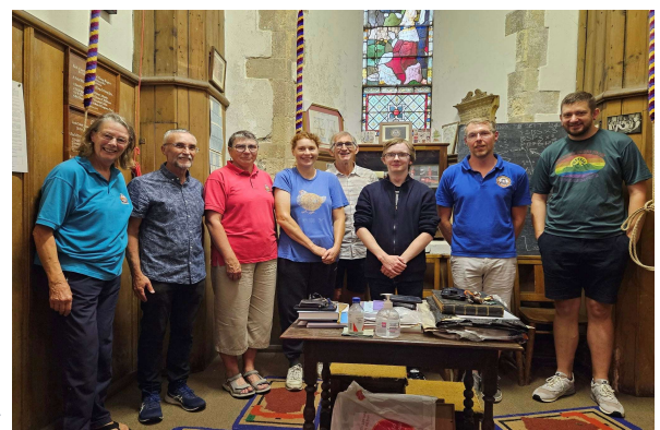
The Bell Ringers