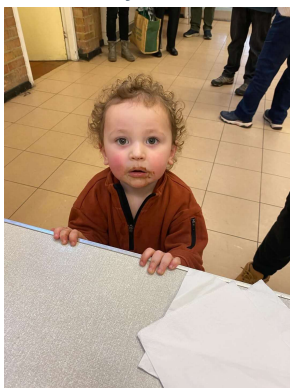
More please! The annual pancake party