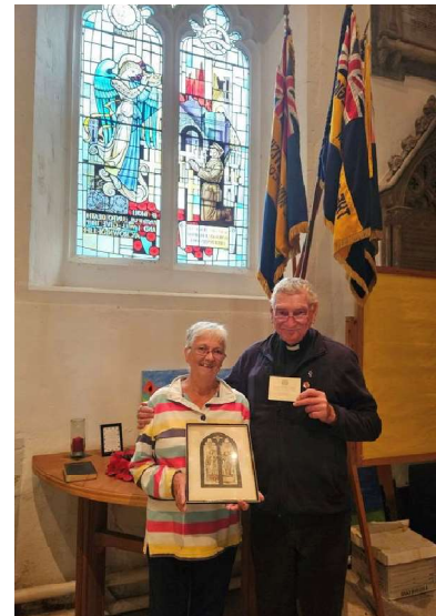
Presentation of water colour