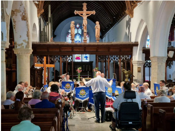
Silver Band concert

or specialist advice and waiting with them until the appropriate help is available. This can be a major test of our desire to make all feel welcome but we are committed to treating all with dignity and compassion.