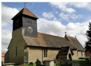
Drayton St Leonard