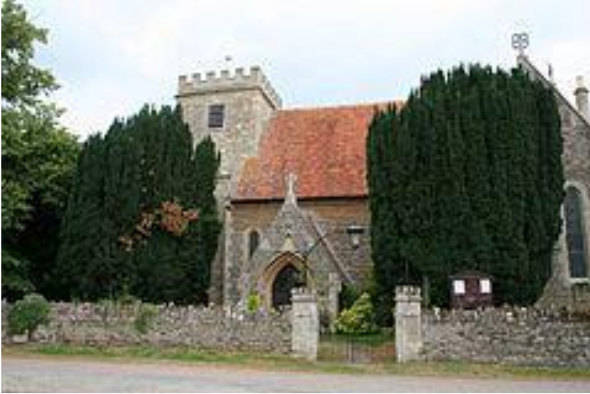
St Paul's Church, Culham

Culham village is a small village on a bend of the river Thames situated 1.5 miles from the market town of Abingdon. The parish is bound by the Thames on the North, West and South.