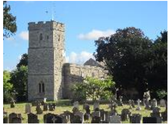
St Mary's Church, Long Wittenham

There are two Anglican Churches in the Parish: St Mary the Virgin in Long Wittenham, a Grade 1 Listed building and St Peter's in Little Wittenham, a Grade 2* Listed Building. Both churches are open during the day and have open graveyards. There are no other denominational places of worship in the parish.