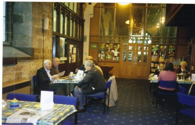
Customers in the Café