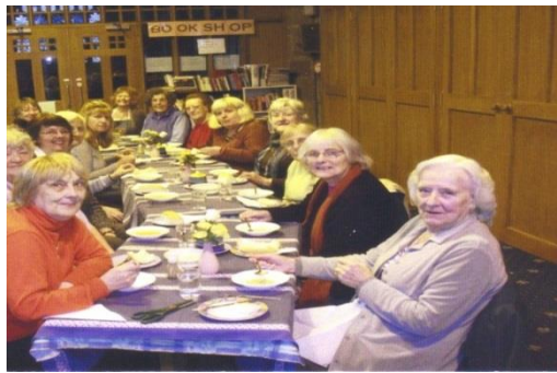
Ladies luncheon club