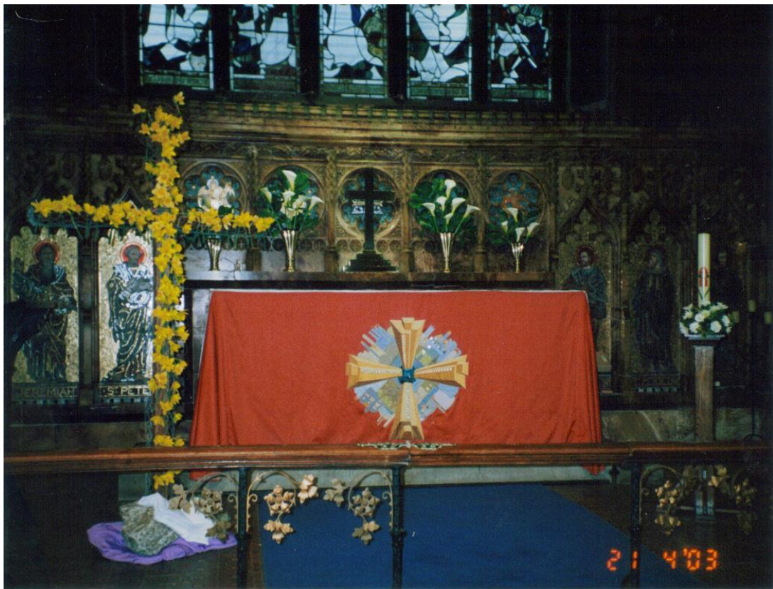
Easter daffodil Cross